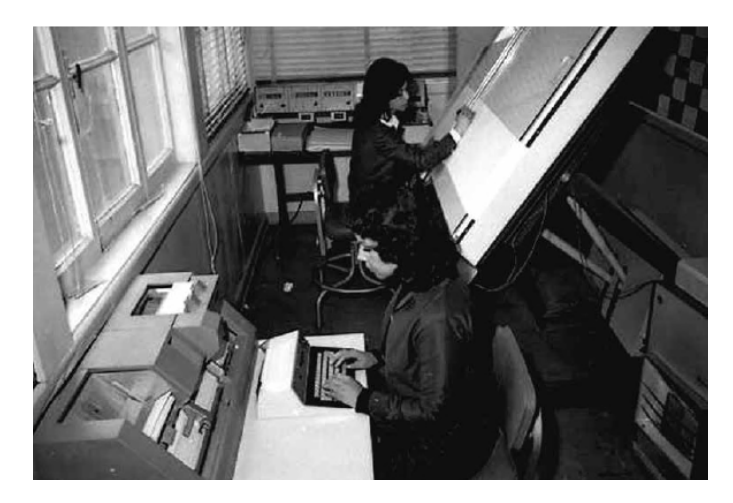
Figure 1: Data processing at the National Center of Oceanographic Data (1970).

It is also important to note that women have played a significant role in the processing of bathymetric tidal and current data, all of which is required for the preparation of nautical charts.