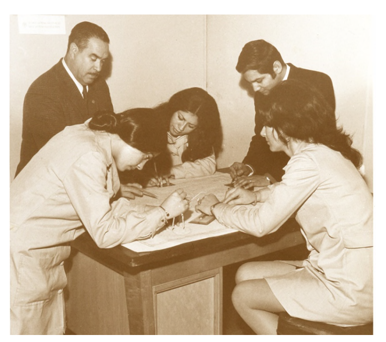
Figure 2: Women working on the production of paper charts (1974).

It is notable that those women who joined the "cartographic production line" fulfilled their function with great meticulousness and precision, an activity that is still carried out today, albeit in a digital environment. The participation of women is expanding as they now join SHOA with basic skills required for the fulfilment of their technical and professional roles. Before joining SHOA, they will have completed their secondary education and taken specific courses in mathematics and technical drawing.