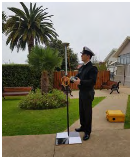
Figure 4.- Configuration of GPS.