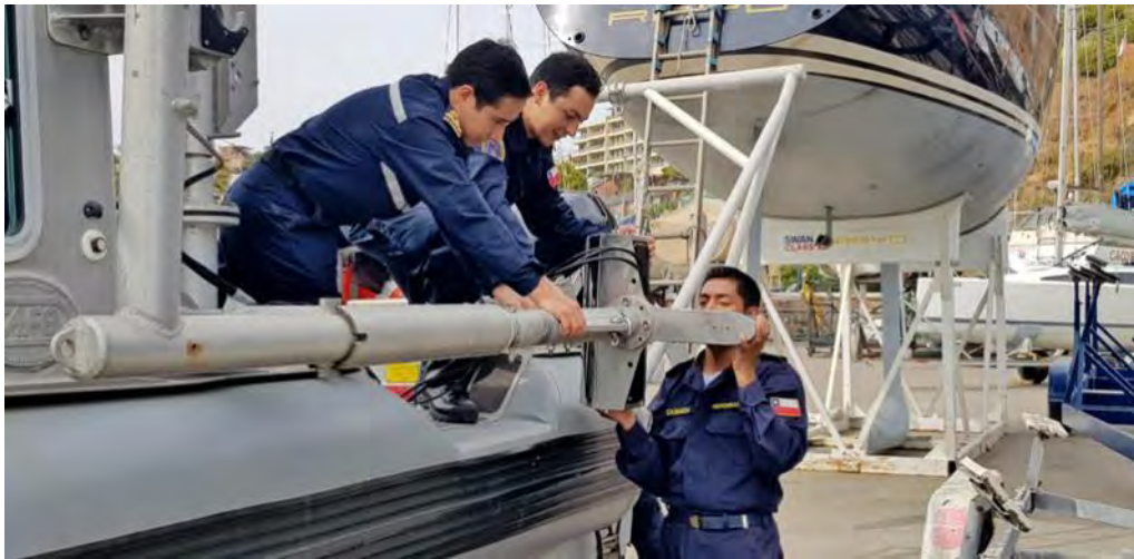
Figure 3.- Practical Activities on board Hydrographic Surveying Vessel.

As the final component of the program, a complex and multidisciplinary work project was included and is divided into two parts: a hydrographic project and fieldwork on board a hydrographic vessel. The final hydrographic project takes place during the entire last semester. This requirement is quite different to the former curriculum requirement, which considered the development of a thesis in parallel to the classroom attendance. The main objective of this hydrographic project is to have students facing the real conditions of a hydrographic survey and at the same time be able to compare the theory and the practice and exercise their learned skills as a capstone to their educational experience. As a result, students should be competently able to design, prepare, conduct and carry out a hydrographic survey of a particular area to generate different marine geospatial products.