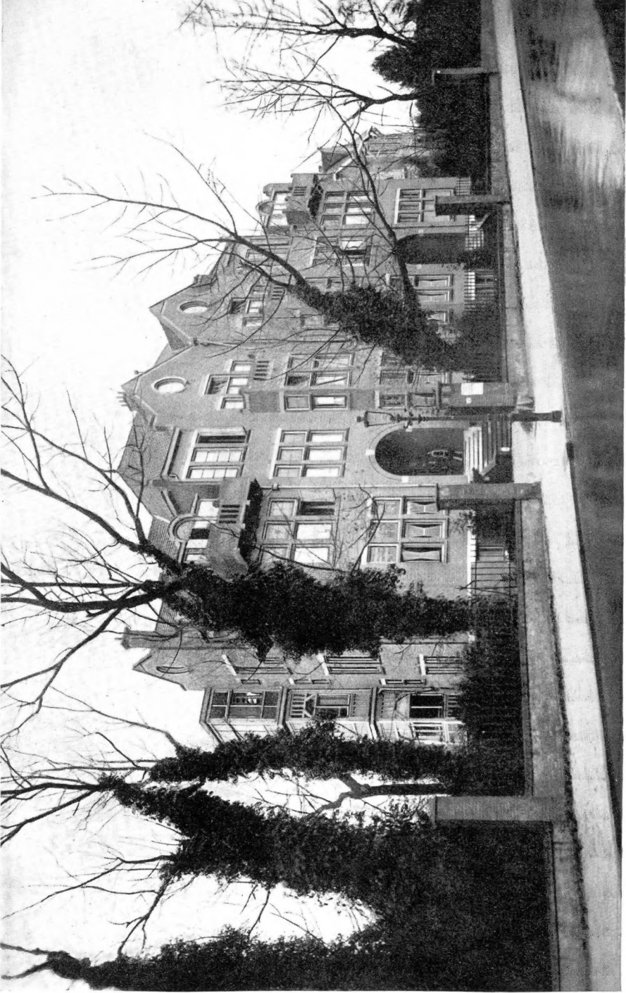
Le Bureau Hydrographique Néerlandais