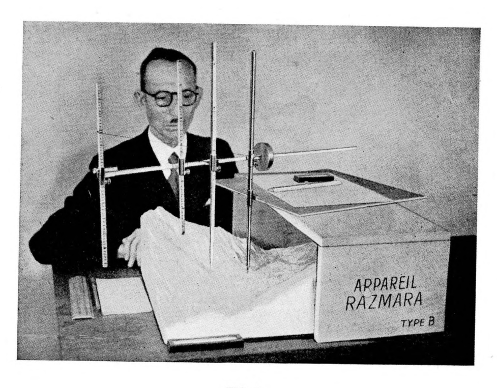
FIG. 2. RAZMARA Surveying Equipment.