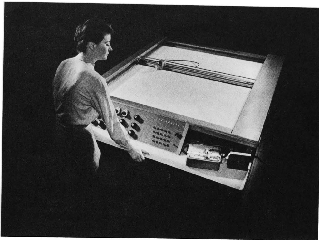
FIG. 2. — Typical Graphplotting for the automatic drawing and printing of information on charts.

This type of equipment may be entirely automatic, and consists of the Graphplotting and Line Drawing equipments developed over a number of years.