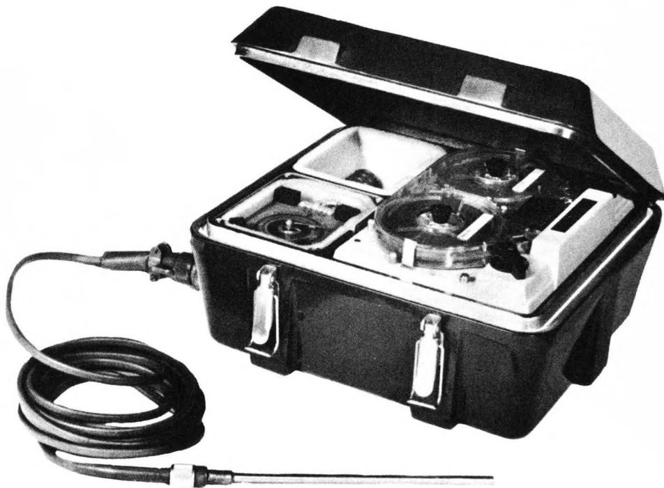
FIG. 3. — Limpet Logger — Field recording unit — the recording from which is suitable for subsequent automatic analysis.

The advantages of a direct digital recorder for field use are obvious and this field of interest has not been neglected. A small, low cost, self-contained, digital magnetic recording unit, known as the "Limpet Logger" has been recently developed. It is designed to operate from external digital or analogue transducers and as an example, at a recording interval of a reading every fifteen minutes, will operate, completely automatically, for periods of a year or more. The equipment is contained in a waterproof case and is able to withstand severe climatic conditions and operate accurately over a wide temperature range.