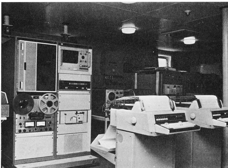
FIG. 2. — Computer room — CTD/O subsystem.

The system has four sub-systems: Navigation; Data Acquisition, Underway; Data Acquisition, Station; and Data Processing. All these sub-systems are interlinked in order to supply a flow of primary or pre-processed data to the Data Processing sub-system. Here the data are re-processed and the output registered in the form of tables and graphs immediately useful for continuous control of measured values and the variations of the different parameters of navigation, geophysics, oceanography and meteorology.