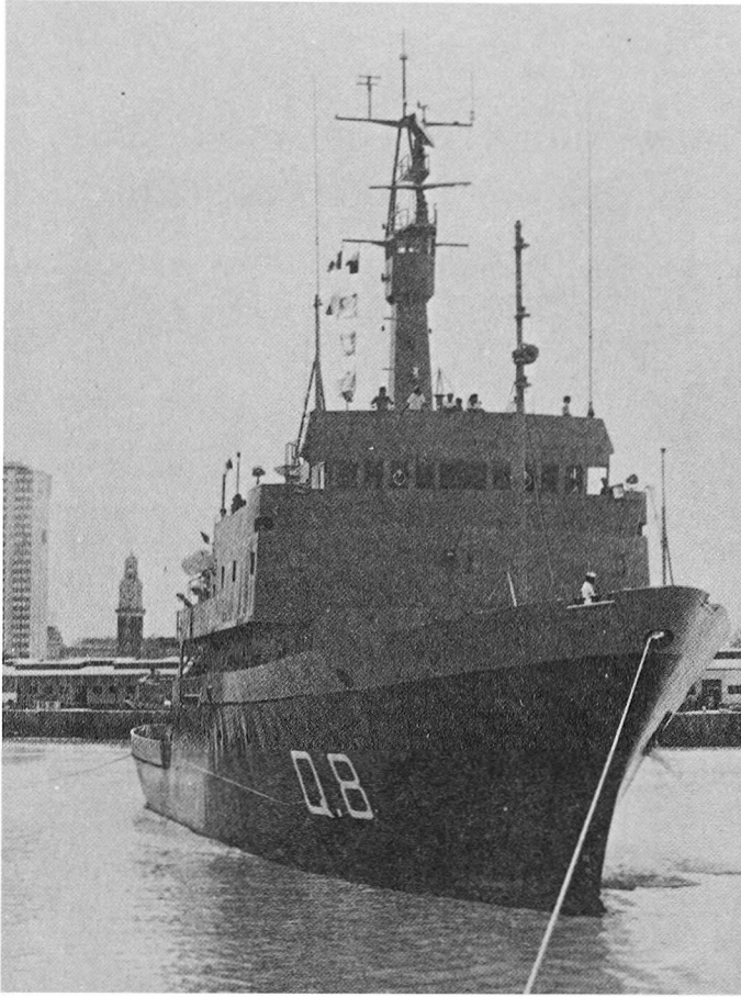
FIG. 1. — The Argentine Oceanographic Vessel Puerto Deseado .

sing system, based upon four Hewlett-Packard computers with a central memory sustained by magnetic disc operates in real time and enables the vessel to return to port after having finished the campaign with all physical, chemical and meteorological data already processed and plotted.