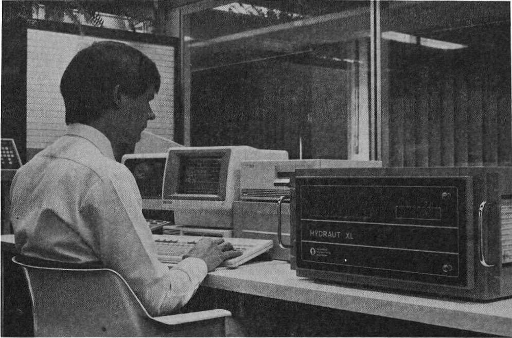
FIG. 1. — The HYDRAUT touch-screen, keyboard, dual floppy drive and computer with single floppy drive