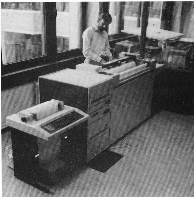
FIG. 4.— The Autocarta charting center II in the Office.