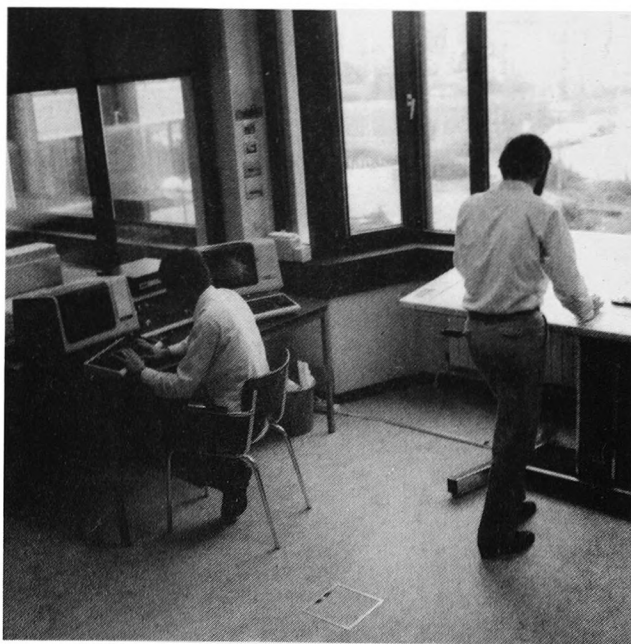
FIG. 5.— The Autocarta charting center II in the Office.