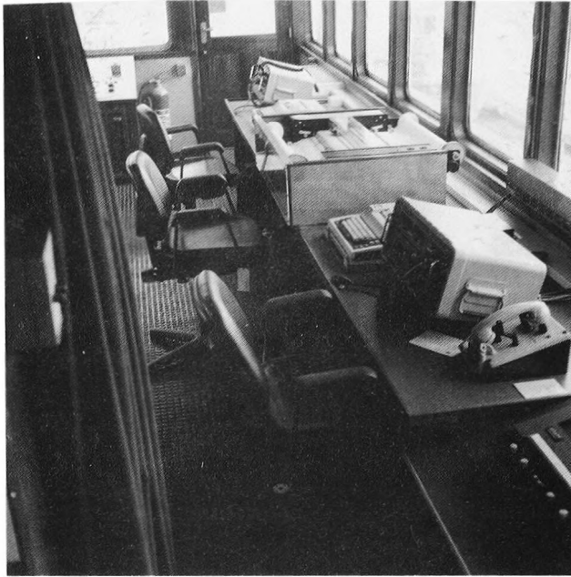
FIG. 3.— The Autocarta II-system on board the Ter Streep .