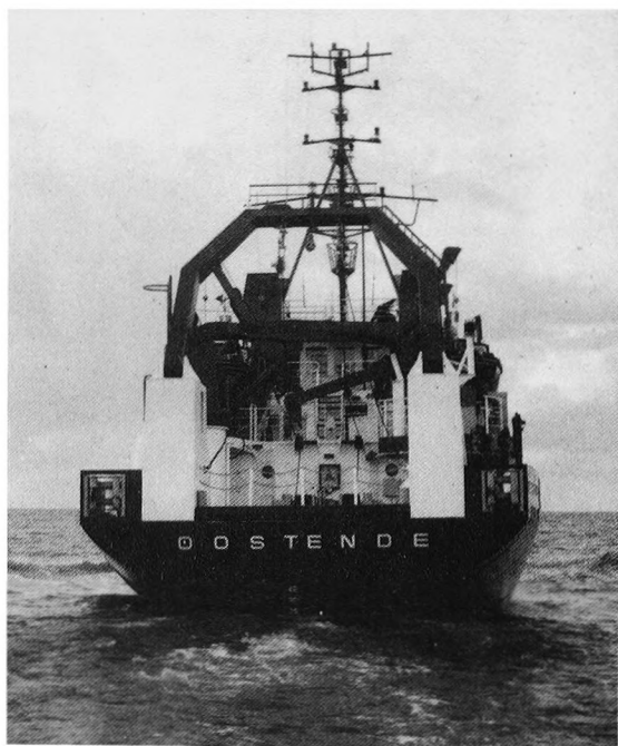
FIG. 6.— Survey vessel Ter Streep : view of the stern.