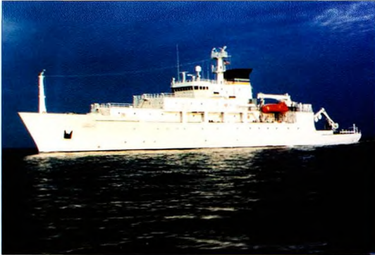
China took military action and lodged protests over 'hydrographic survey' operations by the USNS Bowditch (AGS-21) in China's EEZ in 2000 and again in 2002. Bowditch is one of the seven Oceanographic Survey Ships that are part of the 24 ships in the U.S. Military Sealift Command's Special Mission Ships Program

Military surveys can include oceanographic, marine geological, geophysical, chemical, biological and acoustic data. Equipment used can include fathometers, swath bottom mappers, side scan sonars, bottom grab and coring systems, current meters and profilers. While the means of data collection used in military surveys may sometimes be the same as that used in marine scientific research, information from such activities, regardless of security classification, is intended not for use by the general scientific community, but by the military (Roach and Smith, 1994, p. 248).