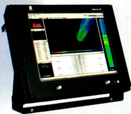
EM 3002 operator display