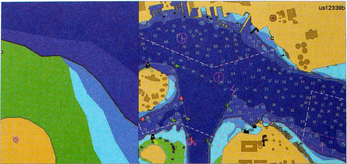
Figure 2: A possible bathymetric colour scheme for ECDIS display

times. What is important is that the mariner knows that this data is contained in the ENC (a database!) and how to display this information (i.e., turn on/off) when needed.