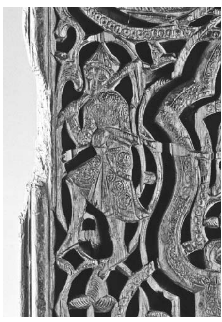
Figure 5. Sculpted Panel with Genre Scene. Cypress Wood, Egypt, 12th century; Musée du Louvre, Paris.