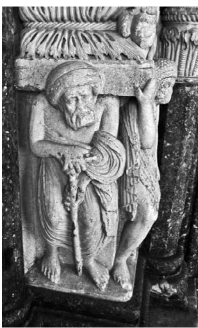
Figure 9. Cathedral of St. Lawrence, Trogir, Croatia — West Portal, Detail.