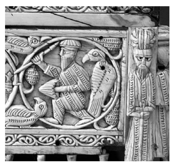
Figure 7. Morgan Casket — Detail. Ivory, southern Italy, 11th-12th century; Metropolitan Museum of Art, New York.