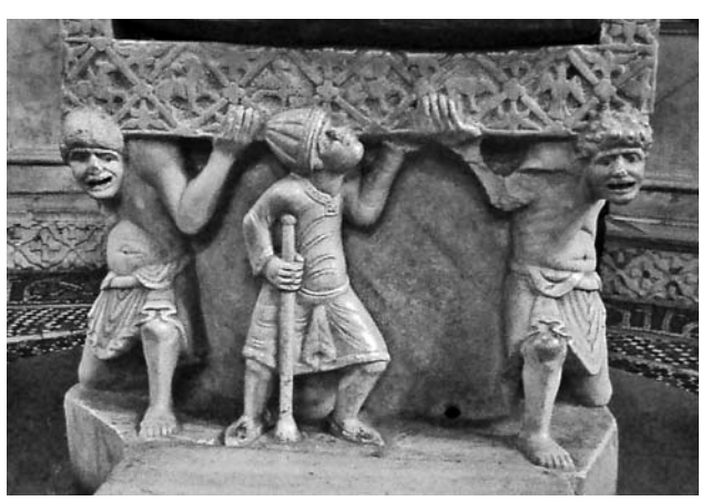
Figure 2. Bari Throne — Front View, Detail.