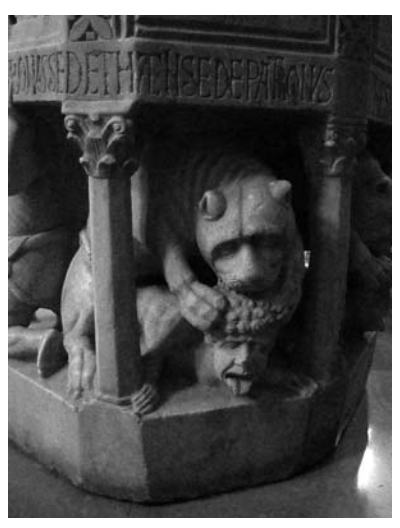
Figure 3. Bari Throne — Rear View, Detail.