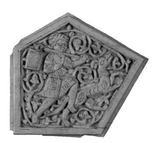
Figure 6. Plaque with Figural Scene. Ivory, Egypt, 11th-12th century; Walters Art Museum, Baltimore.