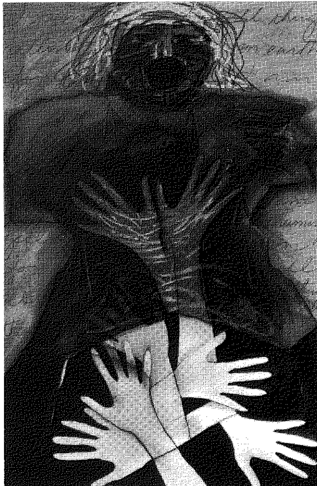
Joane Cardinal-Schubert I Am Calling for All Things on Earth oil on rag 48 inches x 60 inches 1987

the na made pie co sick i cars, a create the fr poten Indian