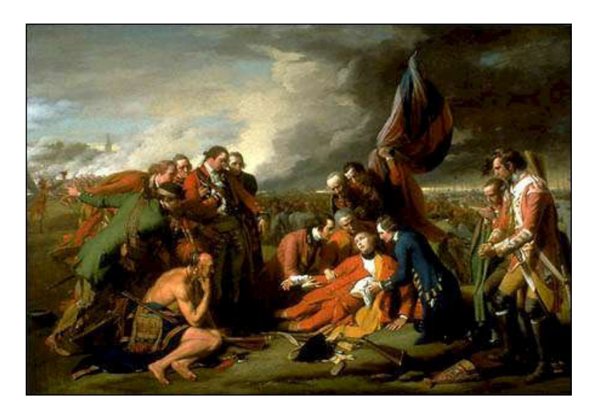
Fig.1 Benjamin West, The Death of Wolfe (1771)