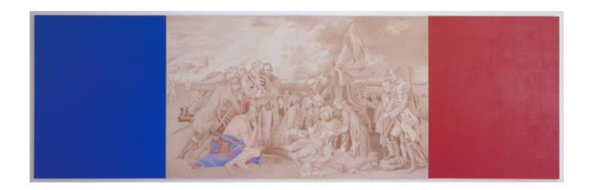
Fig.2 Robert Houle, Kanata (1992)