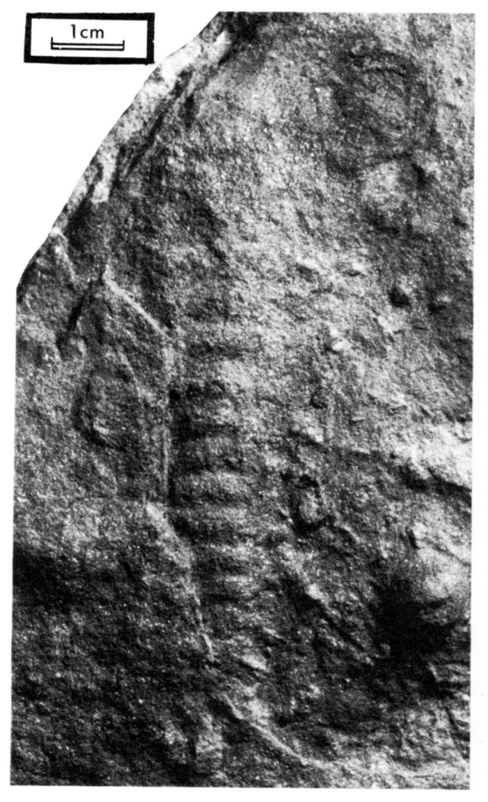
Fig. 2. Arthrophycus isp. preserved on a sandstone sole from the Beach Formation, Bell Island Group, Bell Island, Conception Bay, eastern Newfoundland. Specimen GSC 98485.

(Fig. 1). The specimen is reposited at the Geological Survey of Canada, Ottawa, Ontario, GSC 98485.