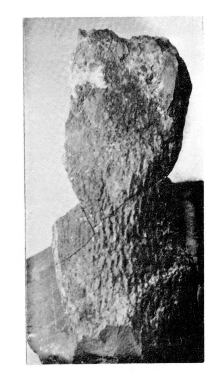
Figure 4. Decorticated trunk of <u>Cyclostigma</u> sp. One half natural size.