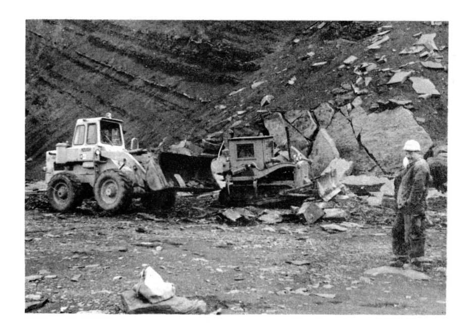
Figure 1. A bulldozer and payloader prepare to remove the track-bearing slabs (on right) from the bottom of the Joggins cliff.

The high tide stranded the party and the equipment for an hour or two, but this did not really interfere with the progress of the work, though this had to be completed in the glare of the vehicle headlights. The final procession of vehicles returning along the beach must have been an awesome sight to the inhabitants of Lower Cove.