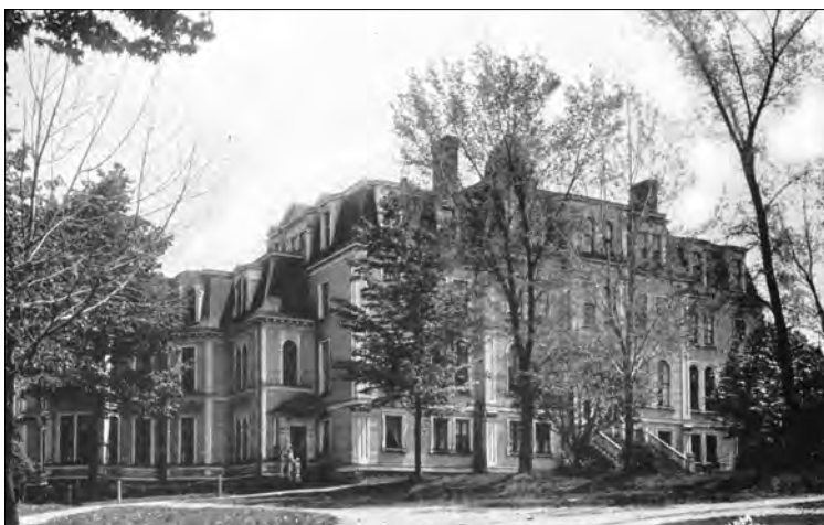
Acadia Ladies Seminary.

Baptist women missionaries understood their job as "bringing Christianity to depraved heathens;" however problematic it appears to us today, to them it was as an entirely righteous activity which expanded their own horizons and those of their sisters at home (96). 3 Missionary women drew strength from believing, like some nineteenth-century American evangelical theologians, that the conversion of mothers had special significance: it is "the most efficient means of Christianizing heathen lands; [...] no culture could be successfully Christianized" until the message of the Gospel had reached women (96f). Baptist missionaries, including men, understood them as best suited to