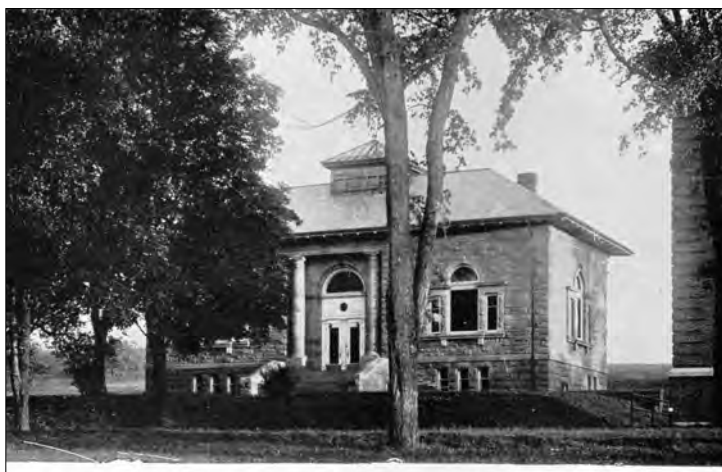
Emmerson Memorial Library.