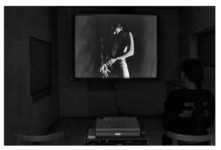
From an installation by Kent Monkman. The projected images are from the film "A Nation is Coming," directed by Kent Monkman.

Why do we do it? Put ourselves through it?