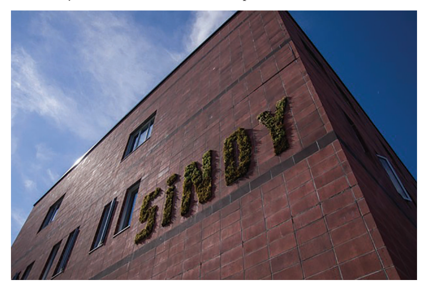
Figure 4: "Sindy."

liberal and democratic structure and performance of governance seeks an ongoing 'settling' of this land" and, in order to secure its sovereignty, Canada requires the death and the so-called disappearance of Indigenous bodies, particularly women. The ties between land, bodies, and women have been established by many Indigenous scholars over the years, notably by Muscogee Creek lawyer Sarah Deer, who, in The Beginning and End of Rape: Confronting Sexual Violence in Native America , explains that "it is impossible to have a truly self-determining nation when its members have been denied self-determination over their own bodies. One of my mentors, Ho-Chunk anti-rape activist Bonnie Clairmont,