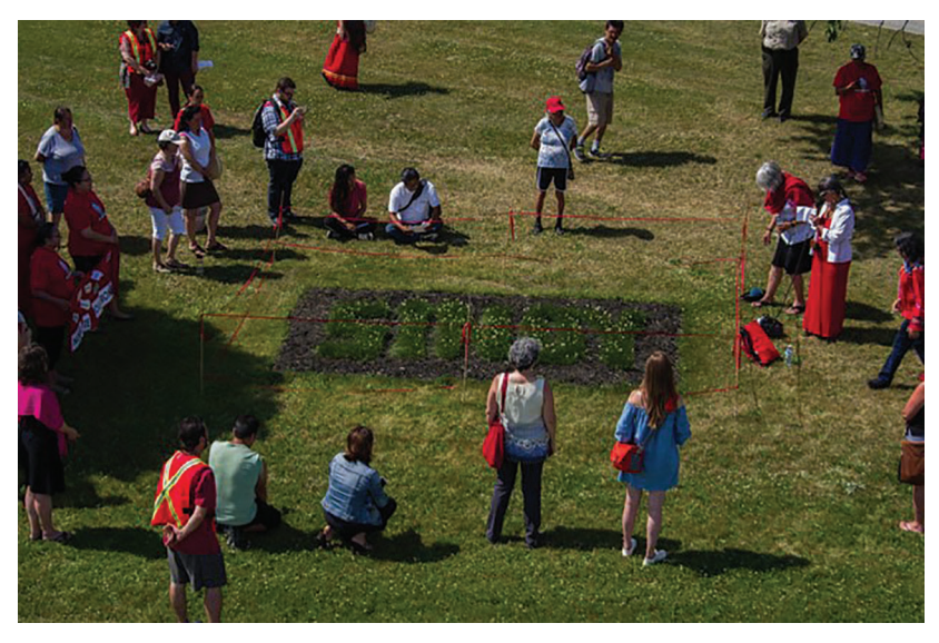
Figure 3: "Sindy."