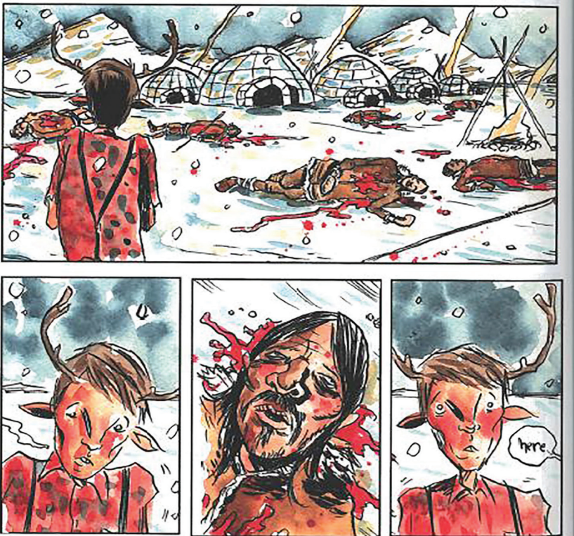
Figure 2 (II: 264)

Furthermore, when the narrative shifts to Alaska, the Inuit become important figures in the plot. When Dr. Singh, the chief scientist for the primary antagonist and warlord Abbott, realizes that the outbreak likely began at a military base in Anchor Bay, Alaska (II: 83), all of the major characters begin to journey north. Although there are mysterious hints of Gus’s connection to an Inuit cosmology when a bear sees Gus as an Inuit