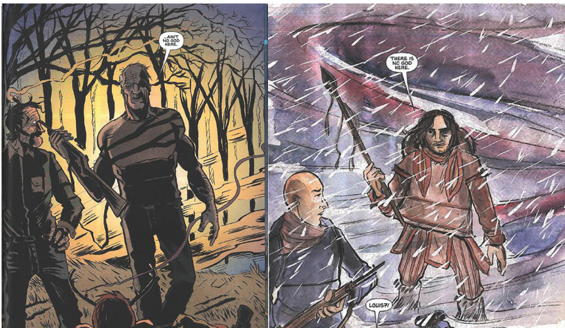
Figures 3 (I: 29) and 4 (III: 26)

The truth is revealed in full two issues later when the narrative provides an explanation of the dream. Matt Kindt, an American comics artist, took over the artwork for three issues to allow Lemire time for other projects, and this resulted in a distinct visual difference between Kindt's work and Lemire's work. Kindt's way of drawing the human body differs such that readers are reminded that they are seeing a new artist's work. However, this visual difference is fitting as the narrative abruptly moves backward from the future to 1911. The first inset caption of issue 28 reads "the personal journal of Dr. James Thacker, September 4, 1911" (III: 7). This narrative flashback and difference in artistic style place added interpretive weight on this section. Kindt includes an ominous sign of a disastrous encounter between the Inuit and European explorers in the shape of a church full of diseased corpses (III: 21). Thacker and his men then encounter Louis, now garbed in Inuit clothing, as he declares that "there is no god here" (Figure 4). This panel