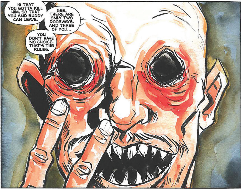
Figure 7 (II: 280)

At the end of the narrative, the only survivors are the human-animal hybrids who make peace with the now infertile human survivors and allow them to die peacefully of disease or old age. Lemire reveals this complete destruction of humanity only in the final issue of the series, and in doing so he breaks from most post-apocalyptic narratives as humanity does meet its final end. Read as a social critique, Sweet Tooth suggests that the “historical” encounter of one group of Inuit with colonialism and disease in 1911 is the direct cause of the apocalyptic end for all humanity in the future. In a strange repetition of the historical settlement of North America, introduced disease again causes catastrophic damage, only this time it kills all humans. Pushed further, the return of disease functions ironically to produce a “new world” in a kind of historical justice granted to Sweet Tooth ’s Indigenous/hybrid children.