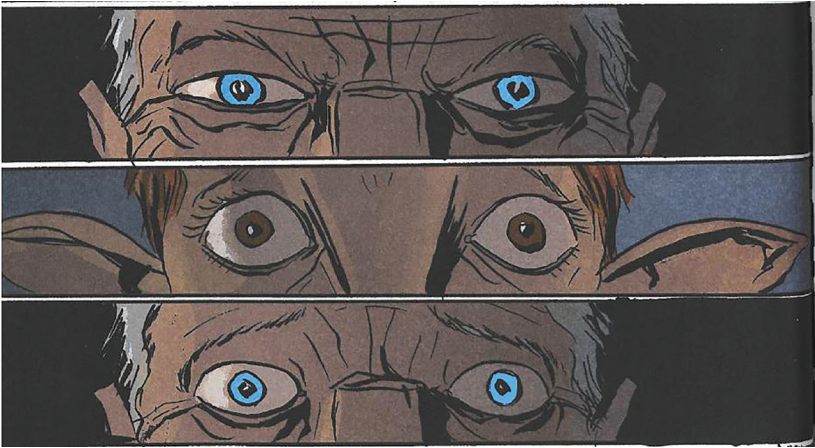
Figure 5 (I: 36)

de Almeida Cardoso argues that Lemire uses the eyes as a “mechanism of sympathetic identification through the gaze” (para. 19). On a narrative level, Gus and Jeppard are looking at each other. On a visual level, readers are given alternating point-of-view shots, placing them in Gus’s and Jeppard’s bodies — we see what they see. But there is a secondary effect whereby Jeppard and Gus seem to be looking directly out of the page at the reader. These panels invite sympathetic identification with the characters, but they also unsettle the reader.