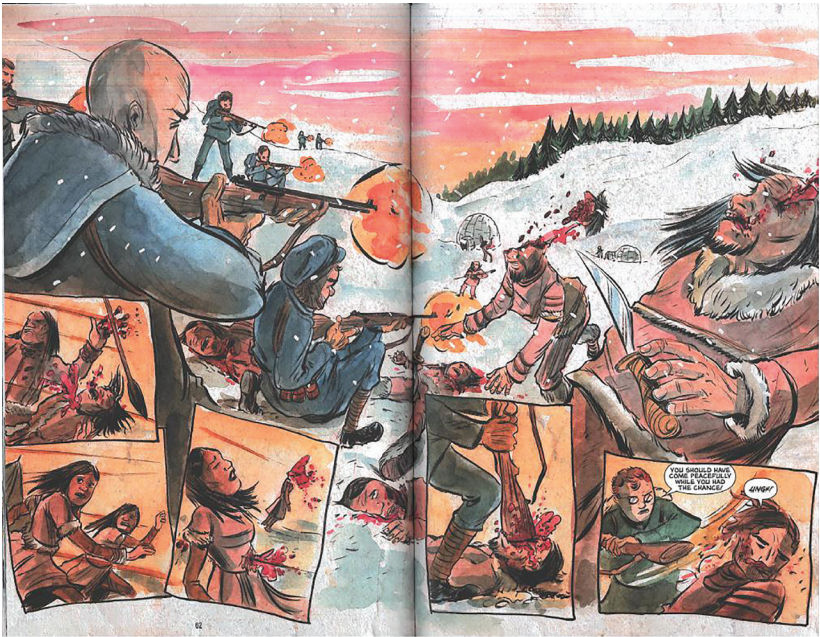
Figure 1 (III: 62-63) 1

TWO-THIRDS OF THE WAY THROUGH Jeff Lemire's post-apocalyptic comic Sweet Tooth , readers are confronted with a visceral two-page spread detailing the massacre of an Inuit community by European explorers (Figure 1). Although Lemire does not shy away from violence in Sweet Tooth , the decision to use a two-page spread amplifies the horror of what unfolds and the cold brutality of James Thacker, a British doctor searching for Louis Simpson, his missing brother-in-law, and the European crew of the expedition. The violence is doubly emphasized by five inset panels that further illustrate the massacre without providing any text aside from Thacker's ironic statement to his brother-in-law that