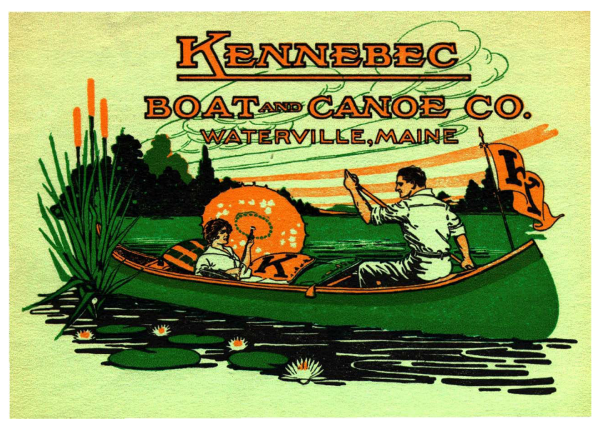
Figure 2. Cover for the Kennebec Boat and Canoe Company Catalog (1918). A typical canoedling tableau, the cover shows a female reclining in the bow on pillows, shading herself with a parasol as she gazes at the man paddling at the stern, in control of the canoe.

as the 1880s, "canoedling" — the canoe-based variant of "canoodling" — was becoming a tableau in popular culture. The image of a man paddling at the stern as he woos a woman reclining on cushions in the bow recurred in magazines, calendars, advertisements, and postcards (see Fig. 2).