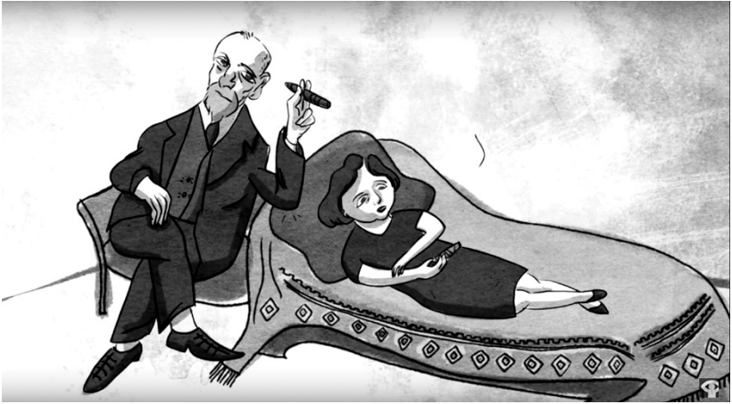
Figure 2: From I Was a Child of Holocaust Survivors (dir. Anne Marie Fleming, National Film Board, 2010); reprinted with permission of Bernice Eisenstein.