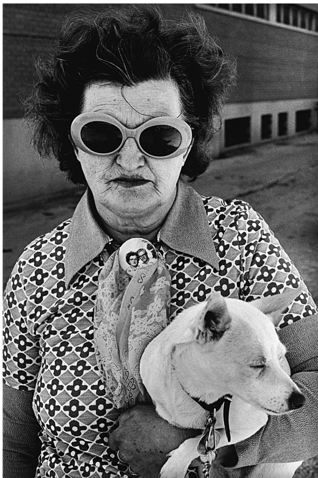
Featured in Geist 66.