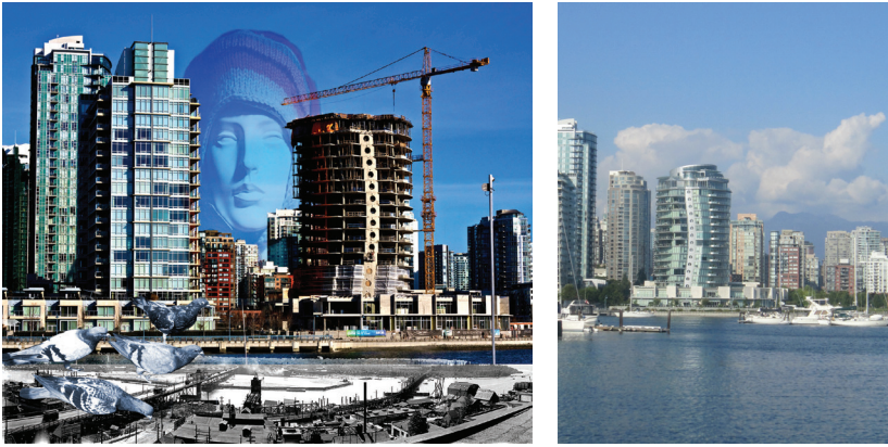
Figure 2. Collage from Mannequin Rising (70, on the left), and Figure 3. Photograph of the same location (on the right).

McAllister observes that his work exhibits a sense of disquiet through technologies of seeing such as the photograph: