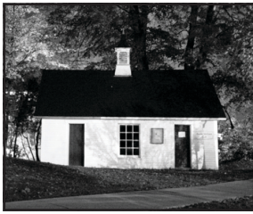
"Ice House" where writers have been meeting for over fifty years.

The University of New Brunswick's Creative Writing Program is one of the oldest and most prestigious in Canada.