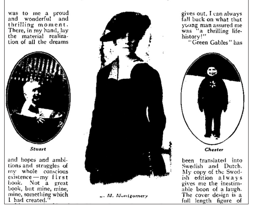
Fig 3. Enlarged "Fifth Installment."

who are conspicuously absent from the content of her memoir. These photographs create a gap between the text and the extra-textual frame, which the audience must bridge in order to make these images make sense. Readers are encouraged to draw upon either their previous exposure to Montgomery's public identity as a wife and mother or, if they are less familiar with Montgomery's life story, the more general cultural climate that would interpret these images of a woman and two children as a conventional relationship between mother and children.