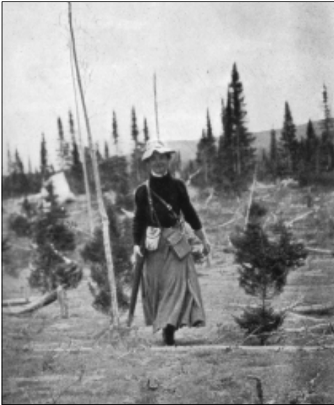
Fig. 5. "On the Trail."

(or at least talking to) the women (fig. 6). She is represented not only as the first white woman to speak to the Innu of this area but, in this photograph, as dominant in terms of her physical position. She stands above them; her raised hand and pointed fingers indicate that she is saying something of import. Contact and communication with First Nations is an essential part of the explorer's work and, the photo implies, such contact and communication was successful. Her narrative, in