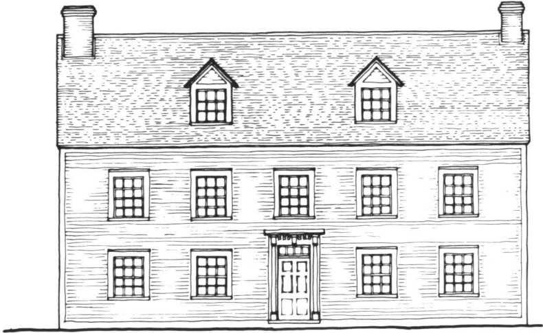
Fig. 2. Elevation of Thomey House (demolished), Bristol's Hope. Drawing by Charles Henley from measurements and drawings taken by Philip Pratt and Shane O'Dea.