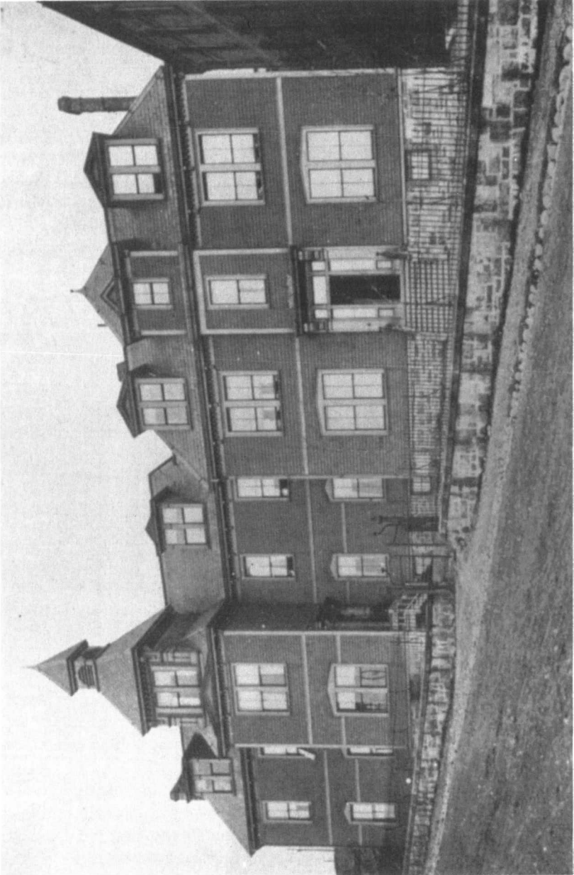
The Methodist College