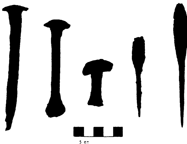
Fig. 2 From the left: wrought iron nail, of a size favoured by Beothuk iron-workers; nail modified, apparently as a scraper; discarded nail head, from which the shaft has been removed; arrowhead manufactured from a nail; another similar arrowhead. (After Pastore 1992: 31).