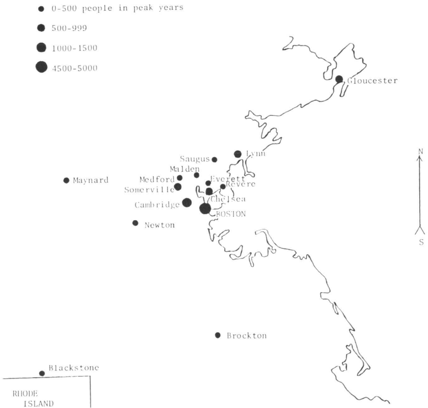
Figure 1. Massachusetts Cities with over 100 Newfoundlanders, 1885-1915

The 1885 data documented the initial movement towards Boston and the fishing port of Gloucester. Once the immigration assumed larger proportions after 1885, Newfoundlanders settled in significant numbers in other cities. The great majority, however, continued to choose Boston and its circle of satellite cities as their destination (Fig. 1).