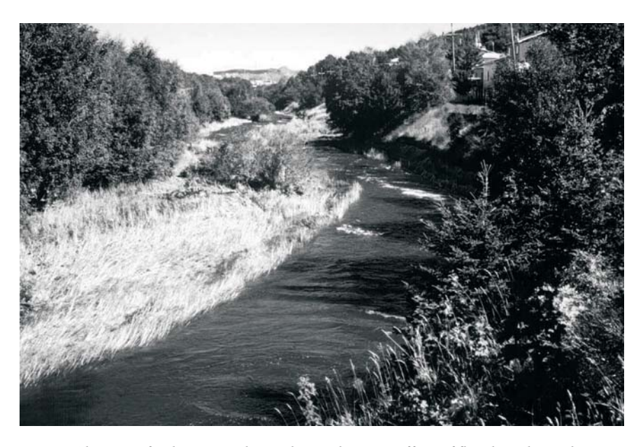
Figure 8b. Waterford River 24 hours later, showing effect of flood, and rapid return to normal water levels.