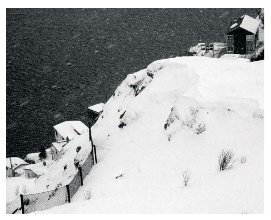
Figure 7. Protective fencing erected above the Outer Battery in 1998.