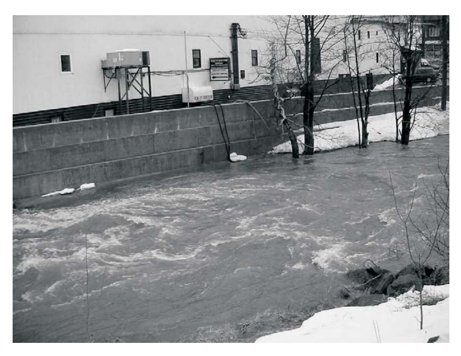
Figure 12. Flood protection, Waterford River, constructed after 2001 flood.

Following recent floods, there has been speculation that the city has become more vulnerable to flooding due to the increase in paved areas and the channelization of streams. Many small streams were confined to underground culverts during development, and, during the Gabrielle event of September 2001, much flooding occured along such former stream channels as the culverts were unable to contain run-off. Open stream channels tend to be able to hold more water before bursting their banks onto flood plains. Development and urbanization results in wetlands and other natural areas that might hold water after heavy rainfall being paved over and turned into hard surfaces. Rain falling on such surfaces is rapidly transported into storm sewers and to the river systems. Thus the effects of a heavy rainfall event change significantly, with more water being supplied to the river systems over a shorter period. This results in higher, shorter duration flood events.