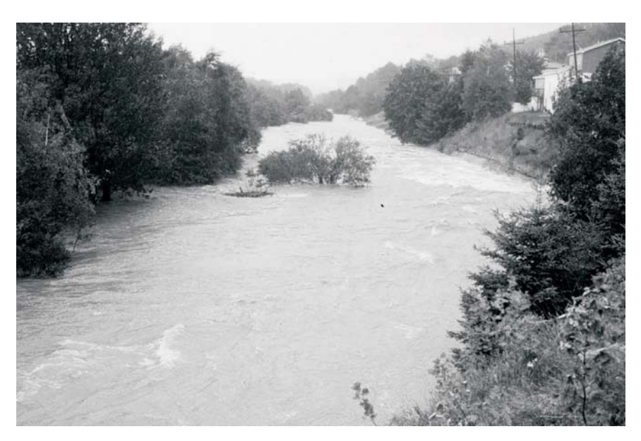
Figure 8a. The Waterford River in full flood, 19 September 2001.