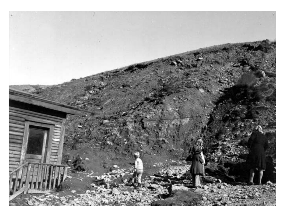
Figure 3. The scar left by the landslide of 15 September 1948 at 387 Southside Road.

Several other landslides occurred in the same storm, with three other houses damaged. The adjoining bungalow (number 389) belonged to the Clarke family, whose members were fortunate to escape without serious injury. The rear of the