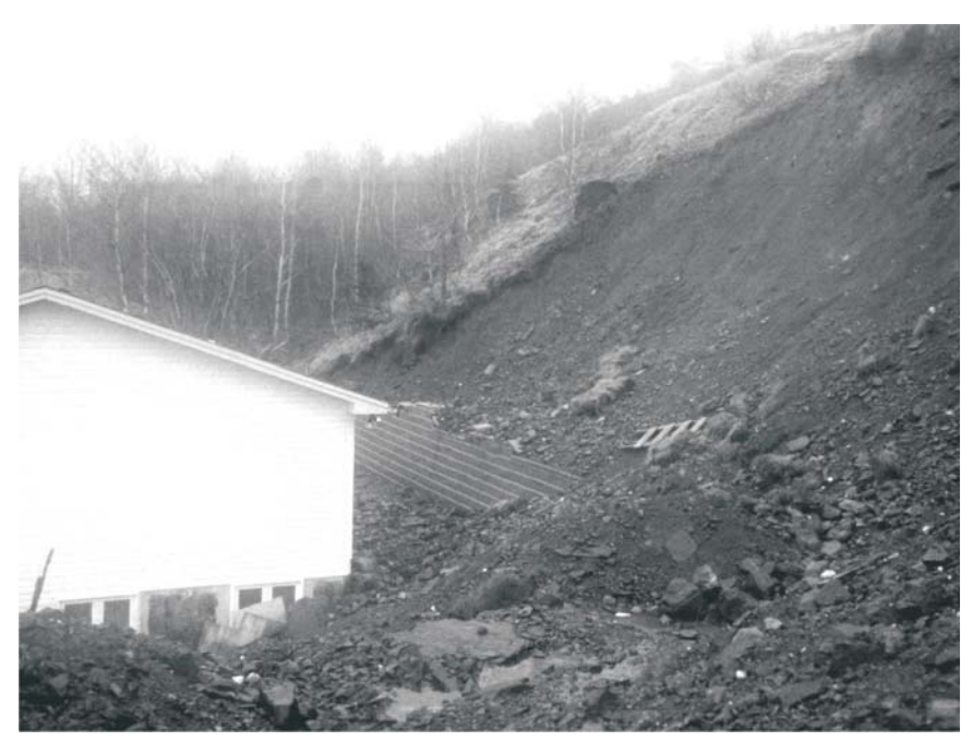
Figure 5. Recent construction on Southside Road, undercutting steep banks of till and increasing landslide hazard.

and the houses cling to a narrow strip between the cliffs above and the sea below. Although protected from the sea, and subject to a favourable microclimate, due to the south-facing aspect, the Battery is among the most hazardous places to live in St. John's. Archival and anecdotal evidence indicates that rockfall is frequent in this area, and that several avalanches from Signal Hill have occurred. In contrast, the north-facing, less steeply sloping Fort Amherst area has not been susceptible to avalanching.