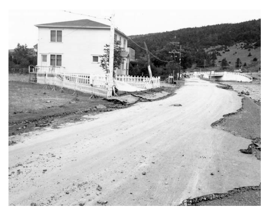
Figure 4. Flood damage on Southside Road, September 1948.

At least three families had to leave their houses because of the damage and were provided with temporary housing, though one family was later asked to leave, as the husband was in employment. In contrast to earlier incidents, there was discussion in the newspapers and in council about where the blame should lie, more