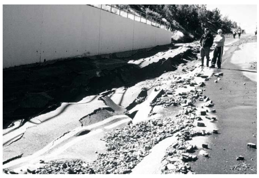
Figure 11. Flood damage on Shea Heights road, September 2001.