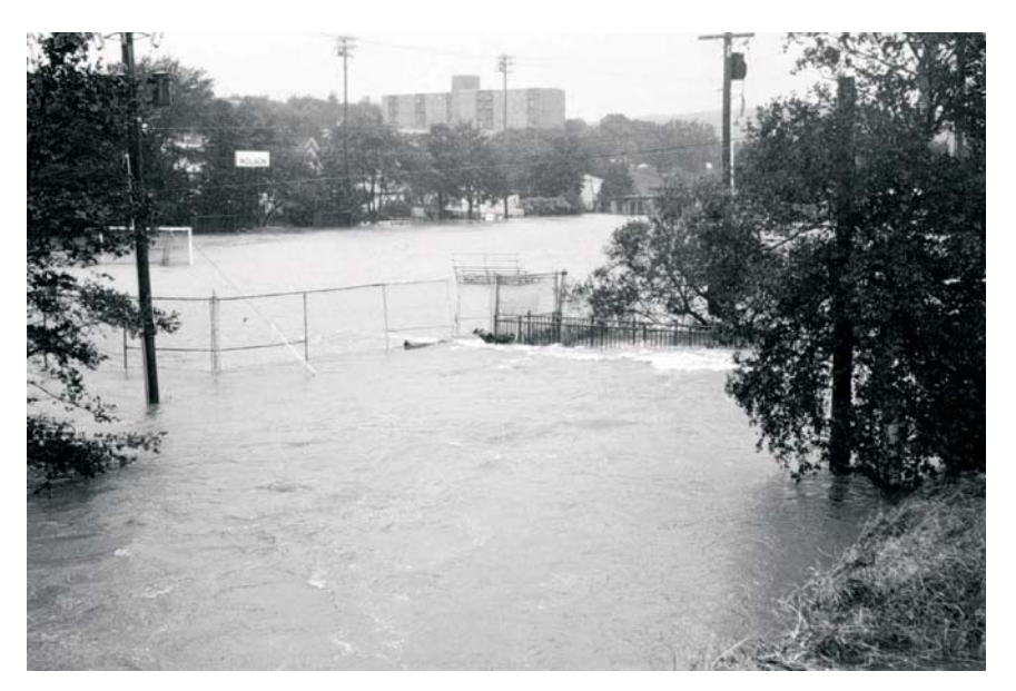
Figure 10. Floods cover soccer field at head of Quidi Vidi Lake, September 2001. Note footbridge over Rennie's River forming dam as it blocks flood waters.