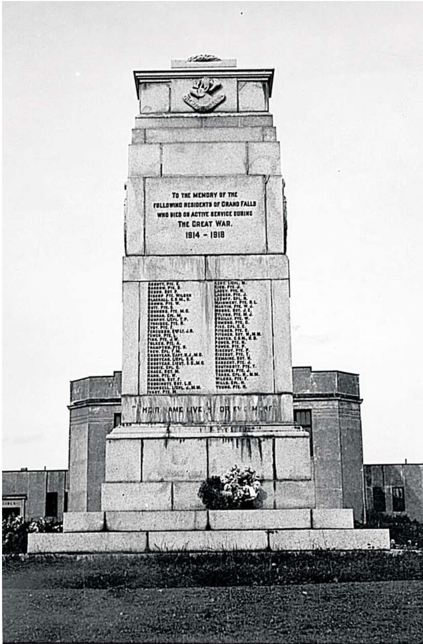
War Memorial, Grand Falls, 1914-1918.