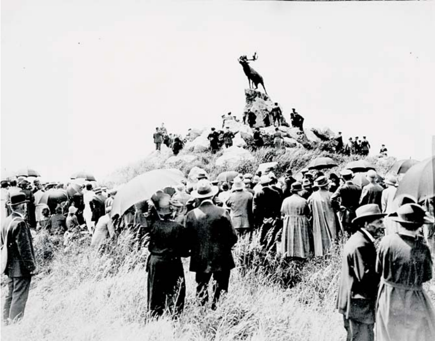
Opening of Beaumont Hamel Park, 1925. PANL NA-3106, Courtesy of The Rooms Corporation of Newfoundland and Labrador, Provincial Archives.

sage. The battlefield was sacred ground which no amount of commemorative development could enhance any further.