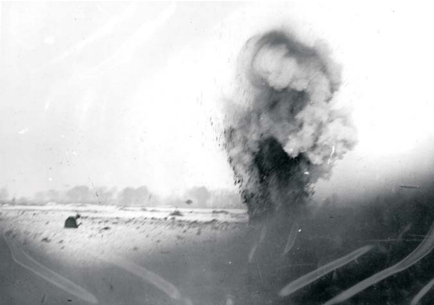
Enemy shell bursting, Beaumont Hamel, c. 1916. Imperial War Museum photograph collection. PANL B-2-42, Courtesy of The Rooms Corporation of Newfoundland and Labrador, Provincial Archives.

The highly anticipated moment came on 1 July 1916. At 7:28 a.m. several mines were blown along the Somme front, and at 7:30 a.m. the infantry advance began. 15 Substantial gains were made by several divisions in the south, but most units were met by a crippling hail of German artillery and machine-gun fire. During the first hour, almost half of the 66,000 Allied troops in the attack were killed or wounded, usually before getting past their own barbed wire. 16 The 29th Division was particularly affected. The 86th and 87th Brigades suffered overwhelming casualties without coming close to their objectives, the first and second lines of the German trenches. The Newfoundland Regiment, a part of the 88th Brigade, received revised orders from General de Lisle at 8:45 a.m., requiring an immediate advance on the German front lines, and hastily prepared for an assault for which it had not trained. 17