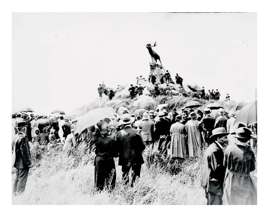
Opening of Beaumont Hamel Park, 1925. PANL NA-3106, Courtesy of The Rooms Corporation of Newfoundland and Labrador, Provincial Archives.

sage. The battlefield was sacred ground which no amount of commemorative development could enhance any further.