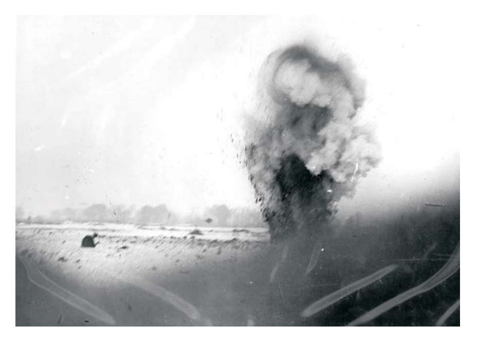
Enemy shell bursting, Beaumont Hamel, c. 1916. Imperial War Museum photograph collection. PANL B-2-42, Courtesy of The Rooms Corporation of Newfoundland and Labrador, Provincial Archives.

The highly anticipated moment came on 1 July 1916. At 7:28 a.m. several mines were blown along the Somme front, and at 7:30 a.m. the infantry advance began. Substantial gains were made by several divisions in the south, but most units were met by a crippling hail of German artillery and machine-gun fire. During the first hour, almost half of the 66,000 Allied troops in the attack were killed or wounded, usually before getting past their own barbed wire. The 29th Division was particularly affected. The 86th and 87th Brigades suffered overwhelming casualties without coming close to their objectives, the first and second lines of the German trenches. The Newfoundland Regiment, a part of the 88th Brigade, received revised orders from General de Lisle at 8:45 a.m., requiring an immediate advance on the German front lines, and hastily prepared for an assault for which it had not trained.