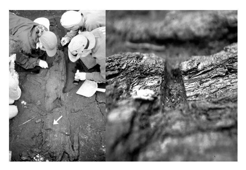
Figure 2. Recovery of Picea (spruce) log in from Maritime Archaic level of the Gould site (left) exhibiting cut marks (right).