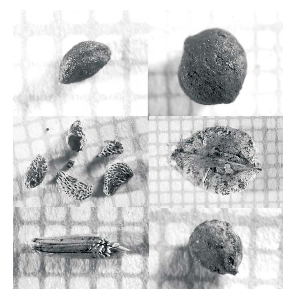
Figure 3. Selected plant macroremains from the Gould site: charred Vaccinium angustifolium (upper left), charred Prunus pensylvanica (upper right), uncharred Rubus sp. (centre left), uncharred Heracleum maximum (centre right), uncharred Taraxacum officinale (lower left), and uncharred Ranunculus sp. (lower right). Scale is one square millimetre blocks on graph paper.

2003). The charred conifer needles recovered from level samples throughout the site may also be evidence for periodic burning of the habitation site, and they are particularly common in the Recent Indian level samples (i.e., 91.4 specimens/litre compared to 11.6 specimens/litre for Maritime Archaic level samples).