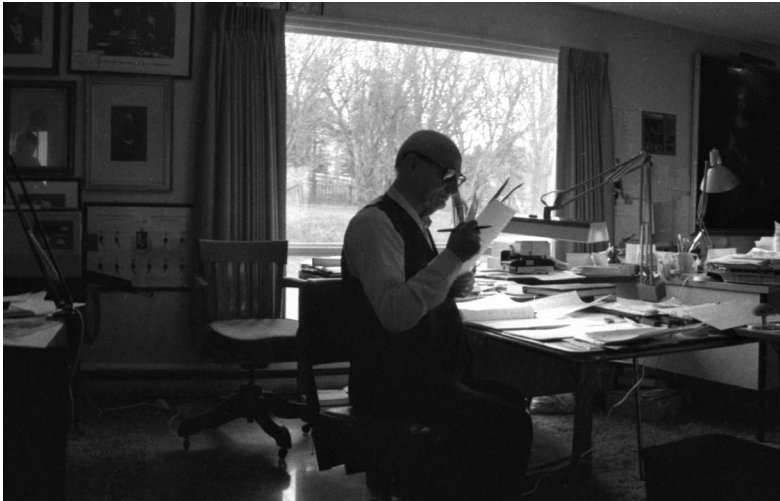
Figure 1. Former Premier Joseph R. Smallwood at work in the main office of The Encyclopedia of Newfoundland and Labrador in 1979.