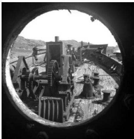
Figure 10. Hulk of Sluga , Hawke Harbour, 2005.