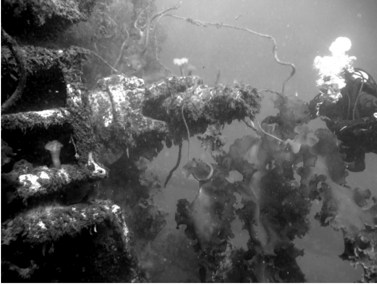
Figure 11. Diving on the wreck: harpoon cannon of Sukha (N. Burgess).