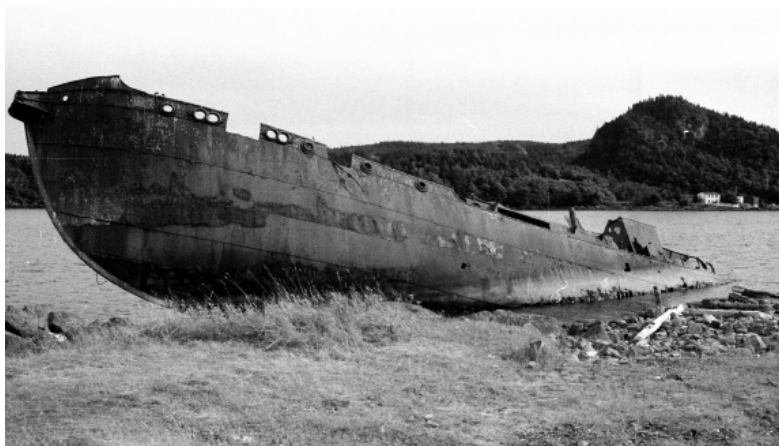
Figure 9. Hulk of Charcot , Conception Harbour, 2005.

yachters. On the island, there is growing interest in those Hawke Harbour Whaling Co. catchers beached or sunk in Conception Bay. The stranded wreck of the Charcot near Conception Harbour (Figure 9) provides photographic opportunities, and the nearby underwater remains of Sukha and Southern Foam are promoting wreck diving.