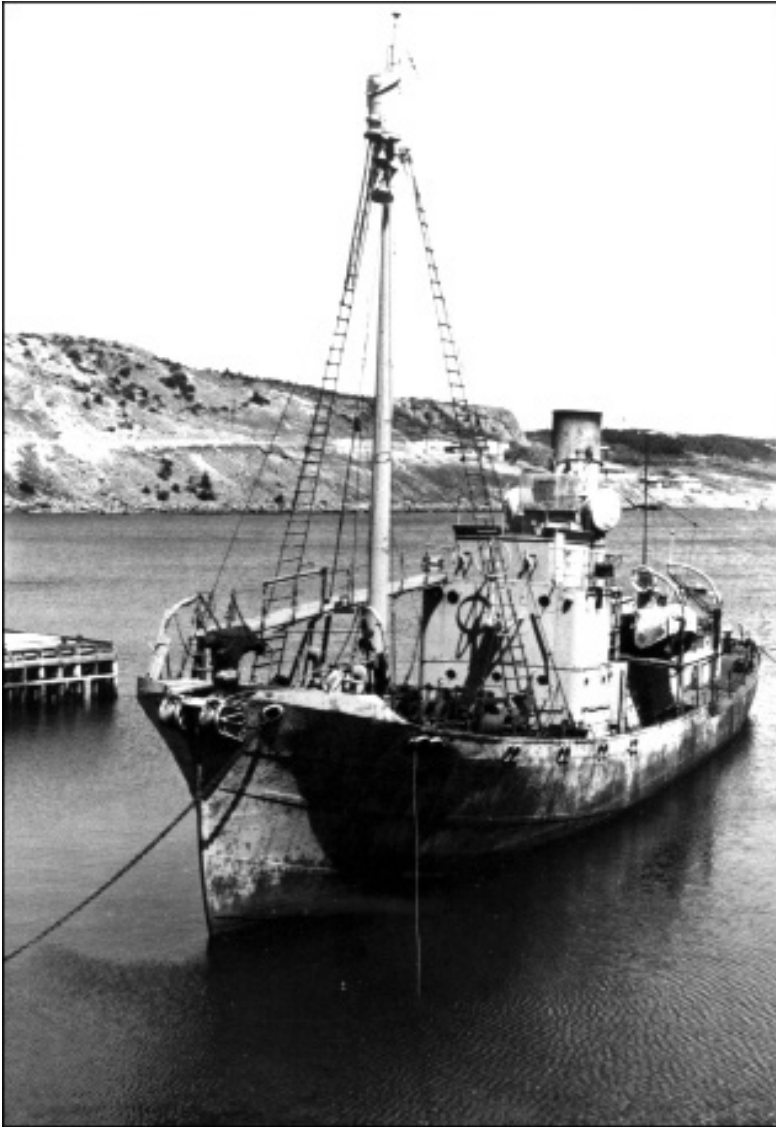
Figure 7. Sposa at Conception Harbour, c. 1953 (D. Flynn).