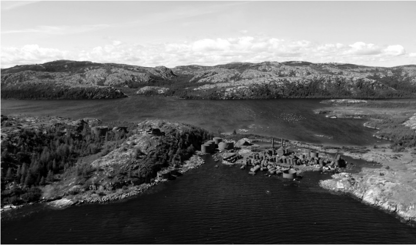
Figure 2. Hawke Harbour station, location and remnants (Canadian Hydrographic Service).

Snook's Arm in Notre Dame Bay, in 1898. 5 Subsequent companies were forced to widely disperse their properties to minimize competition and maximize profits, an ad hoc strategy later reinforced by the Whaling Act when it prohibited stations being built within 50 miles of each other. The lack of specificity as to how this was to be measured, by terrestrial or nautical miles, or in a direct line, led to confusion and complaint, and resulted in the Ministry of Marine and Fisheries defining catching zones for each station. 6 Late entrants to the industry, and those wishing to expand their operations during these early boom years, found themselves occupying increasingly remote locations on the island, and eventually Labrador. Hawke Harbour proved, in fact, to be the most advantageously situated of the stations active in 1906, processing 60 whales for 1,260 barrels (64 imperial gallons per barrel, 6 barrels per ton), an average yield of 21 per whale compared to, for example, 681 barrels (10 per whale) produced from 67 caught from Rose-au-Rue in Placentia Bay.