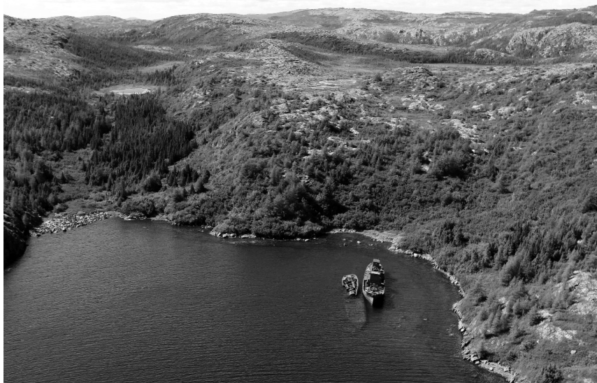
Figure 8. Hulk of Sluga at Hawke Harbour; unidentified sunken vessel adjacent.

industry, was being threatened by large catches, some 36,500 in the years 1951–57. Borgen realized that despite their decreased availability, the large whales still seasonally found off Labrador might complement potheads as a source of meat for the mink and fox farms. Unfortunately, the animal feed market did not improve as fur farms closed due to increased operating cost. Whether or not whaling could have continued at Hawke Harbour for much longer was resolved when the station was destroyed by fire on 12 September 1959. 54 Only 150 whales had been taken (Table 5), using at different times the catchers Charcot , Soika , Southern Foam , Sposa , and Sukba , which Borgen had also obtained from the Polar Whaling Co. A proposal from a speculative new enterprise, the Newfoundland American Whaling Co. Ltd., to rebuild the station failed because capital could not be raised. Whaling from Hawke Harbour permanently ended. 55