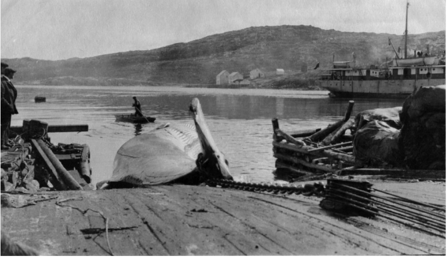
Figure 4. Whale at the slip, Hawke Harbour, 1914.