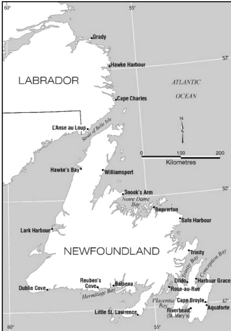
Figure 1. Newfoundland and Labrador whaling stations, 1898–1972 (A.B. Dickinson and C.W. Sanger, Twentieth-Century Shore-Station Whaling in Newfoundland and Labrador [Montreal and Kingston: McGill-Queen's University Press, 2005]).

made commercial whaling a cyclical process, with each phase involving the discovery and exploitation of a new or regenerated stock, subsequent