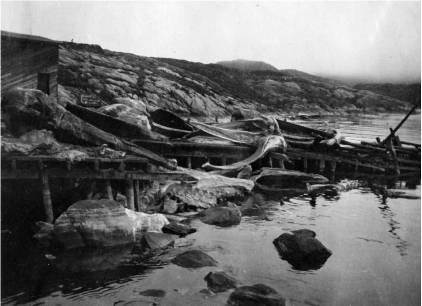
Figure 5. Discarded bone, Hawke Harbour, 1914 (R-PANL VA72-59.2).