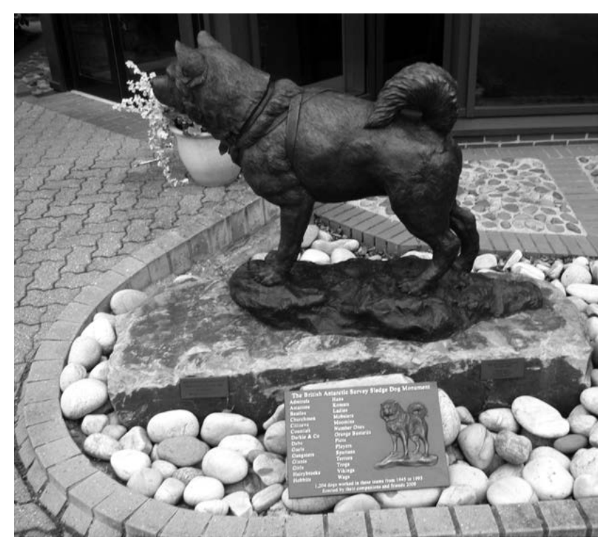
The husky memorial, Cambridge.

In memory of the valuable contribution made by all of the huskies to the operation of the British bases, a statue to them was unveiled on 4 July 2009 outside the British Antarctic Survey headquarters in Cambridge. It now resides in the grounds of the Scott Polar Research Institute, University of Cambridge.