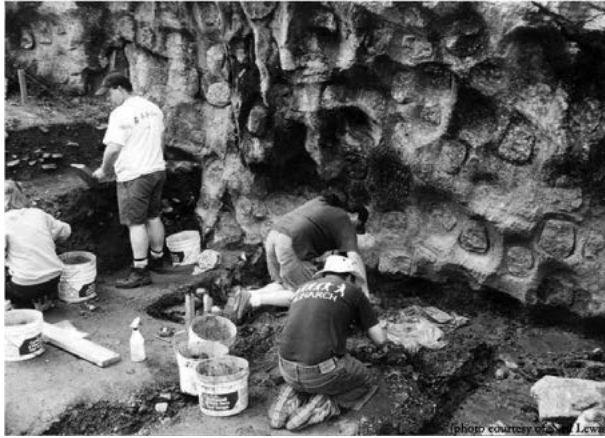
Figure 2. The Dorset soapstone quarry, in Fleur de Lys (EaBa-01).