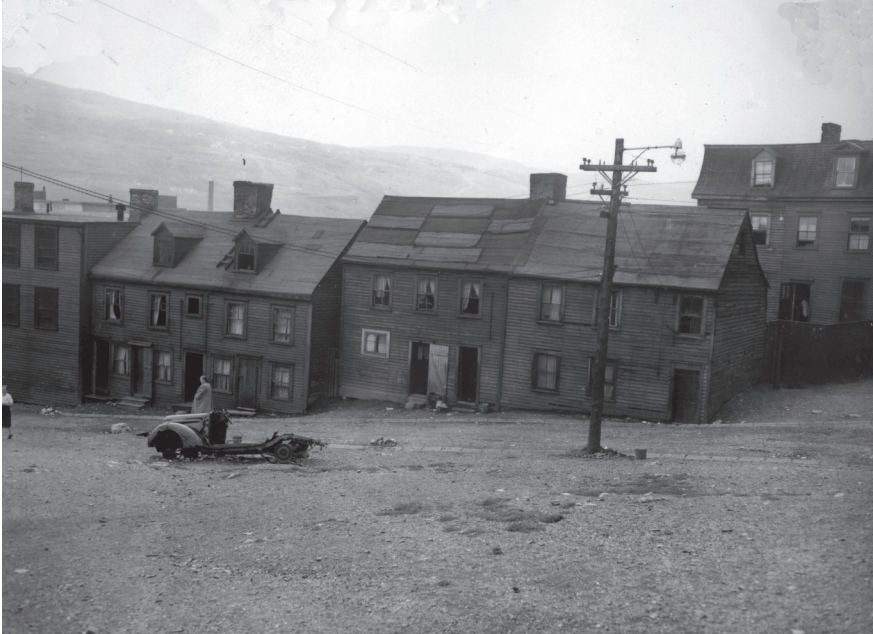
Photo 1: This undated photo shows a woman looking towards the Southside Hills from Cuddihy Street. The current St. John's City Hall is located near this area.