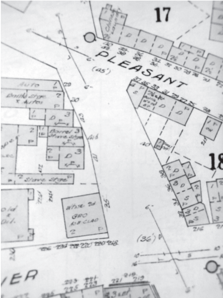
Map 3: This map shows the area depicted in Photo 3.

The need for subsidized and low-rent housing did not disappear with the slum clearance of the 1960s and the NIP and RRAP programs. In fact, Bacher (1993) argues that the latter had the ironic effect of inflating housing prices and further displacing low-income earners. And, as we have seen, the Cabot Place Development removed even more low-income earners from the little