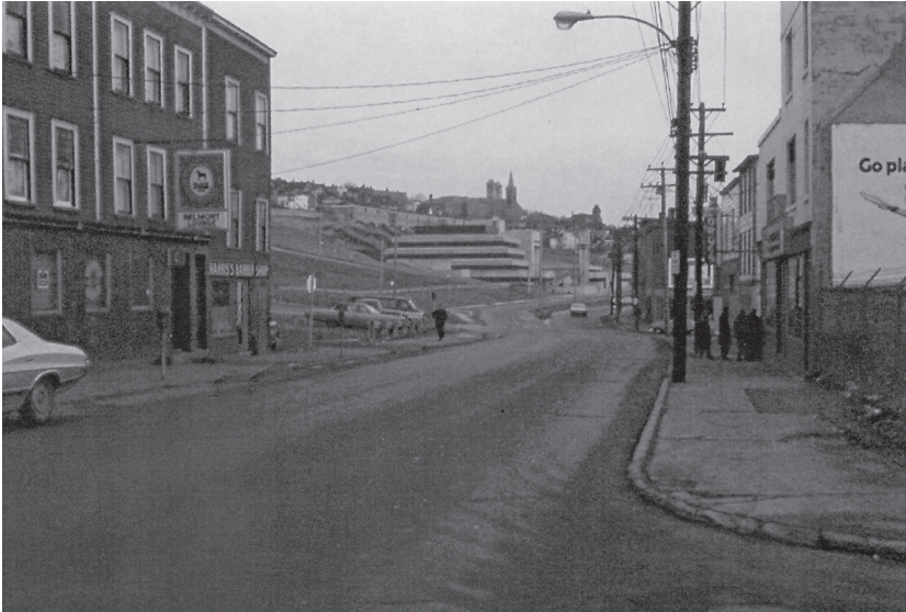
Photo 2: City Hall is the grey structure in the rear centre of this photograph. Notice the vacant land adjacent to City Hall. It stood vacant for nearly two decades. In 1980, once Capital Development Corporation acquired land, this area became the site for the commercial developments that exist there today. The two buildings on the left (the Belmont Tavern and Harris's Barber Shop) were among the structures acquired to build the Raddison Hotel (now Delta Hotel).

the inner-city population (which included the city centre) was in decline. In addition, the company may not have been able to attract enough tenants.