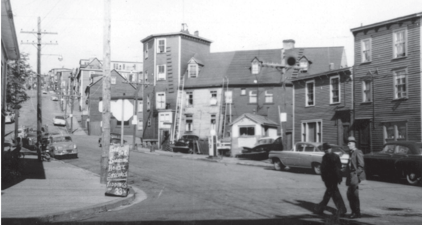
Photo 3: This photo (c. 1950s) shows two men crossing west on New Gower Street at Springdale Street towards a grocery store. The area behind and to the north of the two men is the current location of the parking lot of the Delta Hotel. The author grew up in this area in the 1960s and 1970s.

that was left of the residential area discussed in the opening paragraph of this paper. This was after NIP and RRAP funding for some of these residents.