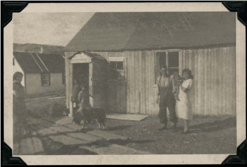
Figure 3. “Eskimos, their home, and one of their huskies — Hopedale.”