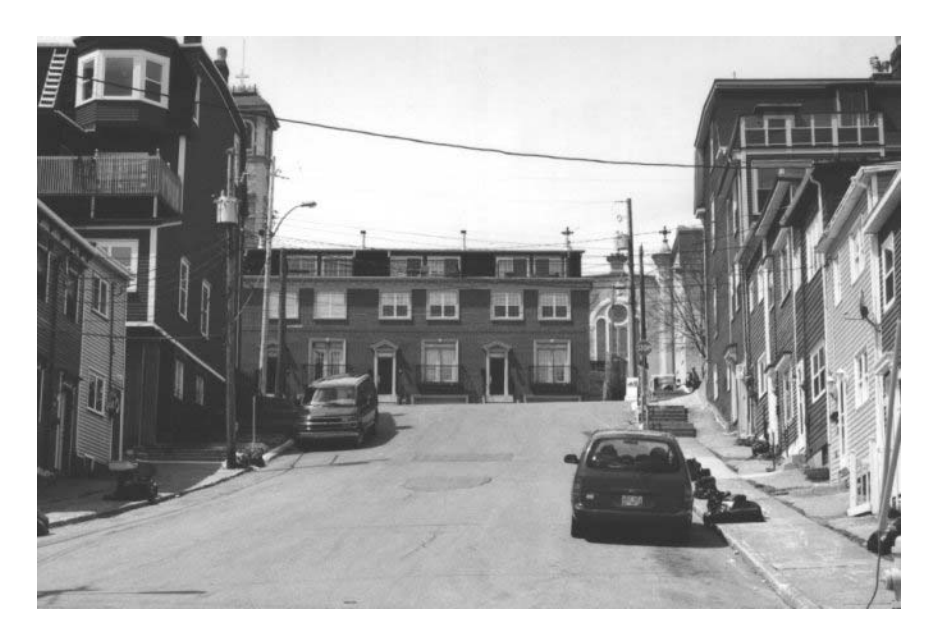
Figure 8. Looking north up Victoria Street to Dublin Row.