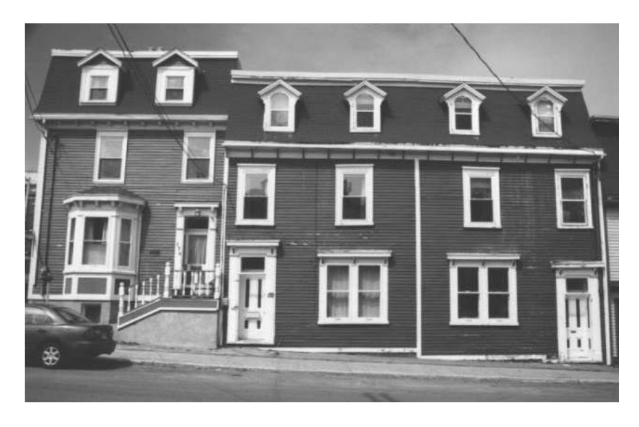
Figure 2. Gower Street houses restored by the SJHF.

The character of the traditional streetscape is thus defined by the repetition of a few basic structural and decorative elements: narrow clapboard, vertical windows, wide trim, eave and window brackets and, although the feasibility study did not make a point of it, mansard roofs on some streets (Figure 3). One of the major shortcomings in the City's heritage legislation is the failure to describe these traits, and embed the requirement that they be preserved in the development control legislation. The 'heritage' streetscapes of St. John's were thus left vulnerable to incompatible alterations. This is not an uncommon situation. In the Old Strathcona HCA in Edmonton, no authentic details requiring preservation were specified. The inevitable result was that "generic old-fashioned" features providing only "hints and references" to the past rapidly appeared on both old and new buildings (K. Wall, 2002: 32). Even Ottawa, with its 11 heritage districts, has strangely limited municipal oversight, since only those changes requiring a construction permit are monitored, leaving roofing and siding materials uncontrolled (Tunbridge, 2000: 281).