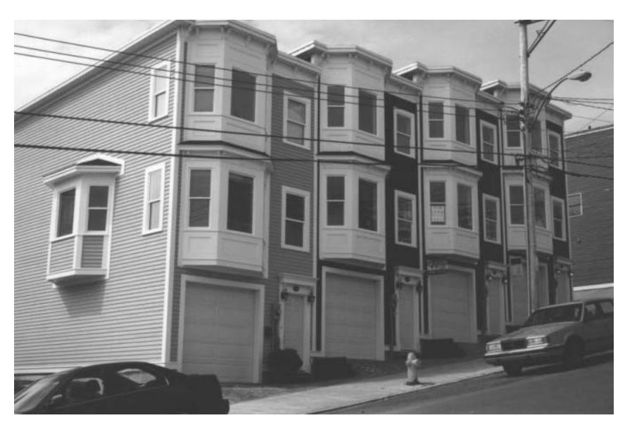
Figure 10. Private infill development on Prescott Street.