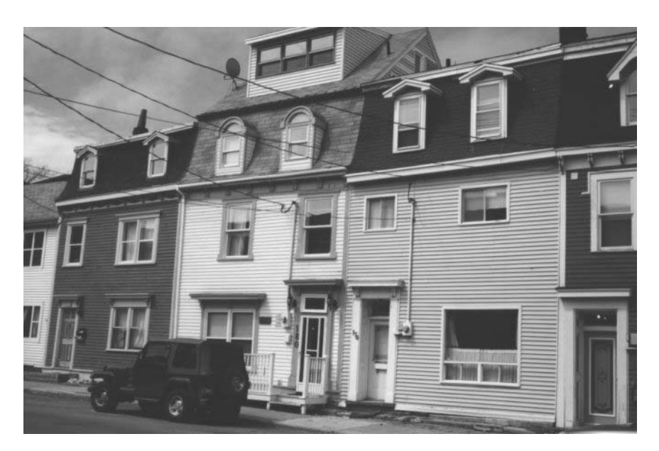
Figure 6. The discordant effect of inappropriate alterations on Gower Street.

provision allowing them to be used as bed and breakfast houses, or condominium units, in order to generate the additional income necessary to maintain them.