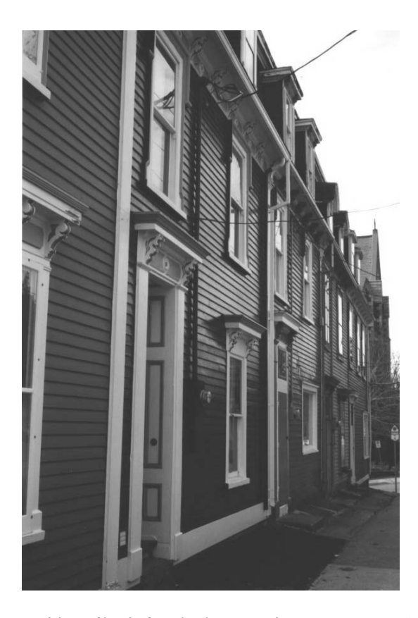
Figure 3. The repetition of basic facade elements gives symmetry to Gower Street.

West End residential neighbourhoods that contain significant groupings of architecturally interesting older buildings that help to form 'heritage streetscapes'" (City of St. John's, 1989: 8) and now covered 167 hectares (413 acres). Freeing the heritage area concept from its erstwhile strictly downtown location, the 1990 expansion represented a major departure from the original concept, and the nearly four-fold increase in the area increased the number of properties within the HCA from approximately 600 to nearly 2,100 (Figure 4). The expansion was cleverly effected by proposing extensions of the original area in three separate local Planning Area Development Schemes. This strategy of piecemeal expansion, while effective in allowing the planners to accomplish what they intended, precluded a public debate on the fundamental question of whether the size of the HCA should be increased. The pragmatic benefits of this strategy are obvious, especially in a city where public support for the very idea of heritage conservation is fickle and muted.