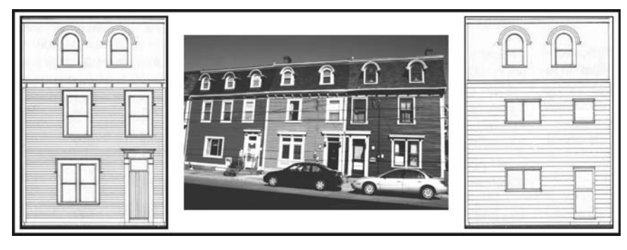
Figure 5. The facade of a traditional house (left), inappropriate renovations (right), and restored houses at 128-132 Gower Street.

The 1984 Municipal Plan required that all buildings in the residential precincts of the HCA "shall conform with other buildings ... originally constructed prior to January 1, 1930, in terms of style, materials , architectural detail and architectural scale" (emphasis added). Council's 1991 design control policy required that "only materials and designs characteristic of the period up to 1914 or thereabouts be used for all repairs and rehabilitation of buildings in the Heritage Conservation Area." However, when the Plan underwent a statutory review in 1994 the City proposed that the language be amended to require only that new development "conform with existing buildings in terms of style, scale and height." This deprived the City of its authority to regulate the use of non-traditional materials on the grounds of aesthetic suitability, and thus to prevent inappropriate renovations (Figure 5).