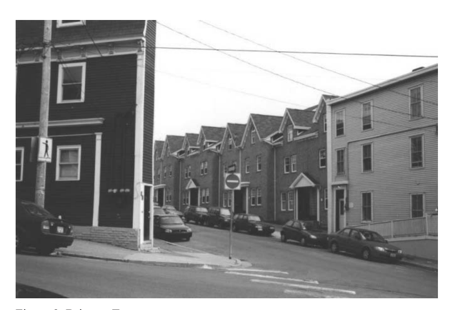
Figure 9. Brittany Terrace.