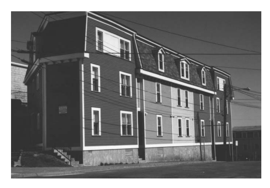
Figure 7. Municipal Infill Housing on New Gower Street.

The second type of damage has resulted from contextually inappropriate infill development. This was not always a problem. During the 1980s the City's non-profit housing agency made effective use of the municipal non-profit provisions of the National Housing Act to create some innovative residential infill developments in the downtown. It was joined by Central Mortgage and Housing Corporation, and the Newfoundland and Labrador Housing Corporation, which also took the time and spent the money to 'get it right' by engaging the services of architects with a proven track record of sympathetic design in heritage areas (Figure 7). Alas, the days of such contextually appropriate development are long gone. Several new developments reflect only the Disneyfied version of heritage conjured up by developers who think that 'heritage' and 'quaint' are synonyms for a generic North American style of downtown architecture. Consider but two contemporary examples.