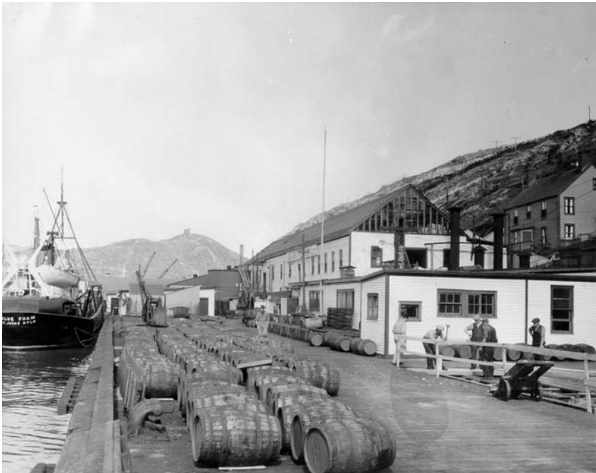
Job Brothers wharf and Southside plant, c. 1950

The Job Brothers processing plant was situated near Prosser's Plantation. It employed both women and men, whose work and numbers changed with developments in the fishery and Job's business interests. From the early decades of the twentieth century, production depended on the seasonal processing round of seals, fish of various species, and, in the fall, blueberries. The fishery had long standing seasonal and gendered divisions of labour, which were replicated within the blueberry industry. Spring seal processing — the flaying (skinning), scrapping, salting, piling, and packing of seal skins for the production of skins and oil — was the work of men. Then small-boat inshore fishermen from the St. John's area, as well as large banking schooners operated by other merchants such as W.W. Wareham or Munroe's, supplied Job Brothers from June to October with fish. 17 The introduction of side-trawlers and other deep-sea fishing technologies in the 1930s and 1940s meant species such as haddock, halibut, flounder, rosefish, herring, and perch were caught in greater numbers. Job Brothers marketed fish products under a number of brand names: Hubay and Labdor brine frozen salmon, Hubay quick-frozen fillets, Flag brand smelts. They handled dried codfish, cod oil, seal oil, seal skins, pickled herring and salmon, canned lobsters and salmon, and fresh, frozen, and smoked fish. Job Brothers marketed their blueberries in the United States under the name