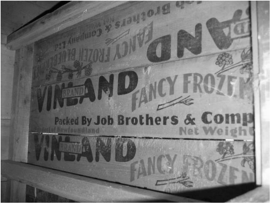
Wooden boxes from Vinland fancy frozen blueberries (photo courtesy of the author, 2007).

ries in lined boxes or cartons, placed “hot wrap” of cellophane around the packages and made them ready for storage, by men, in wooden boxes in the cold storage room.