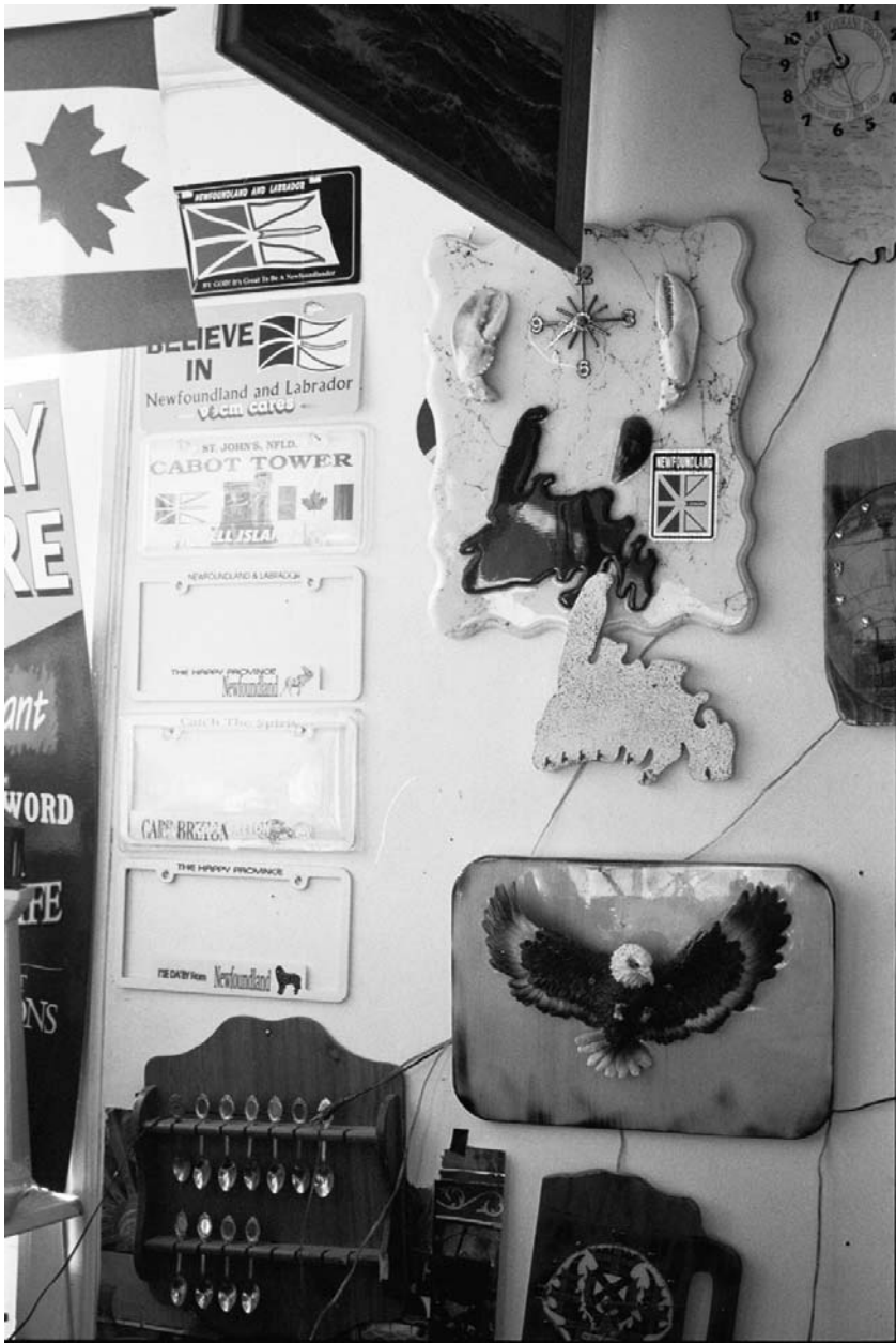
Figure 3. Newfoundland license plate holders, wall clocks, and plaques on display at Claremmichael's Maritime and General Shoppe, 1258 The Queensway, Toronto, November 2002.