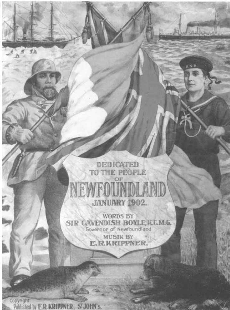
Example 4. Title page of E.R. Krippner, Newfoundland . 89

as local composers responded to the Boyle legacy in their own individual ways. One such work was “Newfoundland Isle of the Free,” a spirited march composed by Bishop Feild College headmaster William Walker Blackall with image-laden text by his brother, the Rev. D.W. Blackall. The song text evokes striking connections to the romantic landscape of Boyle’s Newfoundland: “What land like thee, our island home, Strong amidst the ocean foam ...” As a review of the premiere of Blackall’s song suggests, Newfoundlanders were becoming increasingly cognoscente of an emerging canon of national songs: “The sentiments contained in it are so full of the real New-