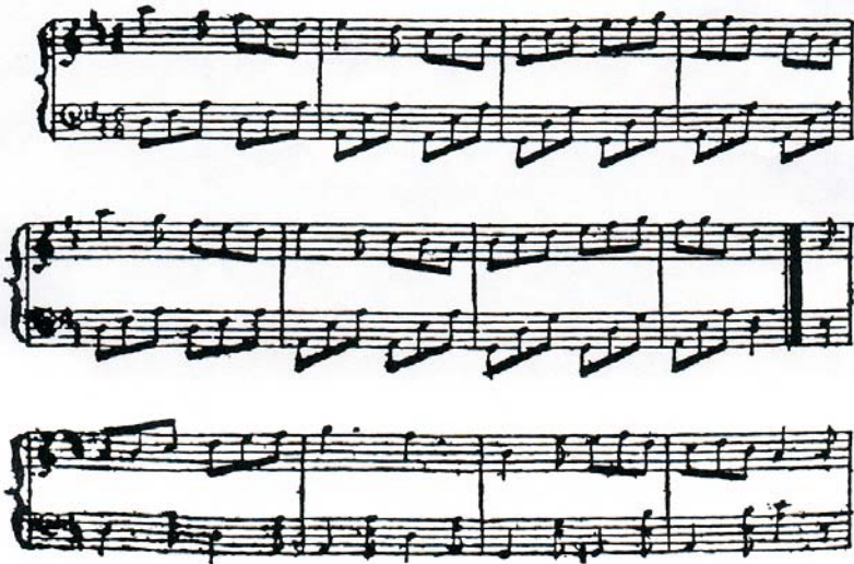
Example 1. Francis Forbes, The Banks of Newfoundland , mm. 1-12. 28

BOSTON Published by OLIVER DITSON 15 Washington St