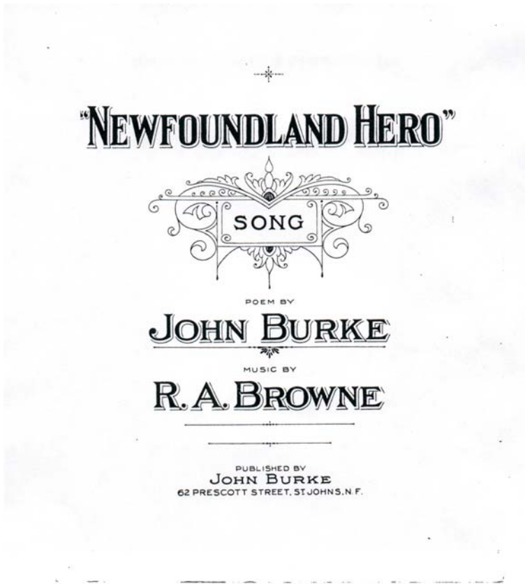
Example 2. Title page of John Burke and R.A. Browne, Newfoundland Hero . 71

Middle Arm, White Bay of the Royal Newfoundland Regiment , as well as a rare musical score entitled “Newfoundland Hero” (see Example 2). One of only a handful of Burke songs to be published in sheet music format, it is his only known score to be published in Newfoundland. 70 No doubt Burke the entrepreneur felt the subject matter to be especially marketable to the Newfoundland musical public given the patriotic spirit of the times, yet there can be little doubt that the sentiments are genuine and that the unusual importance accorded the song was reflective of the fact that Burke, like most Newfoundlanders, viewed Ricketts as a national icon. As with