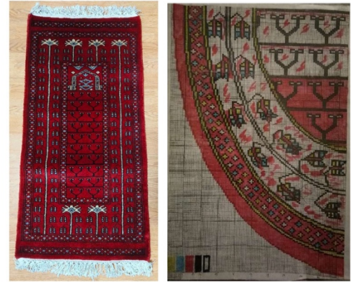
Figure 5 Naksha showing parda pattern.

Patterns: In ACW, generally the Bokhara pattern is woven, wherein a single motif or a floral-box is repeated throughout the carpet. In this category, the leading design currently being woven is called parda (curtain) in which a cup-resembling motif is repeated throughout the carpet giving a semblance of a curtain (figure 5). This cup-resembling motif is of a fixed dimension and is woven in 19x19 rows and columns, in black colour, taking shape beginning with the ninth column in the first row. Due to its fixed dimension, the motif does not alter its size even in larger carpet-sizes where only its frequency increases and an additional border, resembling the border on the sides, is repeated in the middle of the carpet, which bifurcates the whole design into two equal windows in which these cups are repeated. Around 6 colours are usually woven in parda pattern: black is used for the motif outline, another colour for the carpet-background, and the remaining colours for other smaller motifs in the borders.