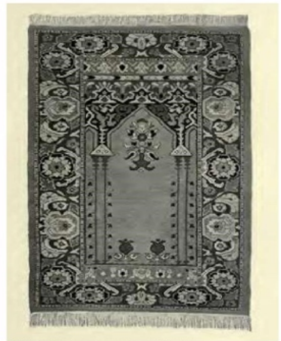
[Fig. D. Amritsar Prayer Rug, 5.10 x 3.4, Holt 1910: 64-65.]