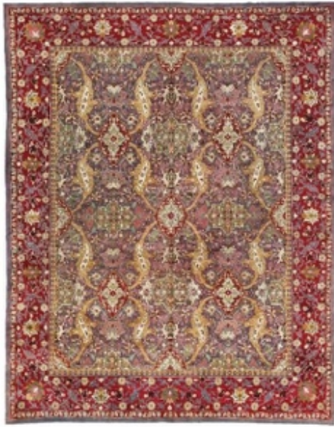
[Fig. Antique Amritsar Carpet, 1890 15'1" x 11'5", Farnham Antique Carpets, UK]