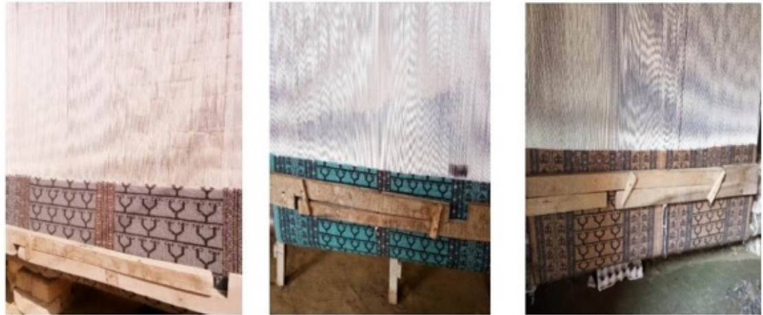
Figure 8a (Left), 8b (Middle), 8c (Right) Looms from three villages.

patterns whose digital designs were sourced by the owner from another weaving-city, Gwalior.