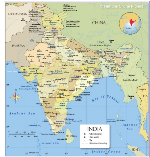
Figure 2 Map of India showing Srinagar and Amritsar in northern-most states.

creation on graph sheets, is being done with the exception of one manufacturer who sources digital designs from outside Amritsar.