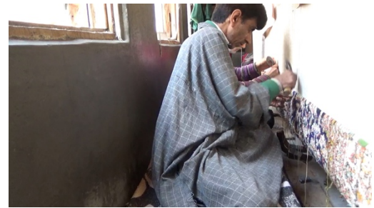
Figure 4 In KCW, weavers sit on backside of the loom while lower rollers point towards the other side. In ACW (figure 3), weavers sit on the side facing the rollers.

columns. 4 The quality of graphs in ACW has altered over the years with 16x16 graphs being used in the 1980s and 10x18 graphs being used from 2000 onwards, which further reduced to the 10x16, 9x16 and 8x17 grid-graphs being used at present, showing decreasing columns in the grid-block measuring an inch. This reduction is often compared with a corresponding decrease in the carpet's quality/knottage over these years. K. K. Goswami remarks that, “The quality of