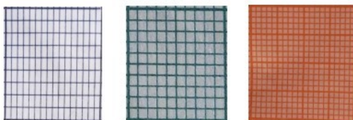
Figure 7 Grid blocks in different graph representations.