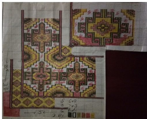
Figure 6 Afghani dabbi pattern.

adjacent room and was read aloud by a weaver at loom-1. The reading consisted of largely disjointed phrases, e.g. “leave four, weave three,” “weave five black,” “weave seven blue,” etc. Apart from this demonstration, no naturally occurring reading aloud of naksha , either at karkhana or at home-loom in villages, was observed. This contrasts completely with the engagement of talim in KCW where not only is it necessarily consulted, but it is read aloud like a text in an extremely rich, cryptic trade-language among the weaver teams. This reading aloud significantly transforms weavers’ code-perception and facilitates team communication and coordination in KCW (Kaur 2020).