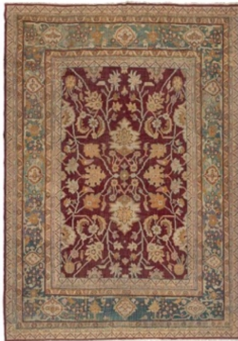
[Fig. C Antique Amritsar Carpet, late 19 th Century, 7.9 x 9.2, Heirloom, USA]