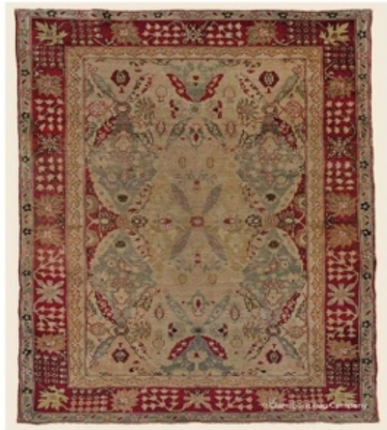
[Fig. B Antique Amritsar "Garden Rug", 1875, 3' 10" x 5' 10", Claremont Rug Company, USA]