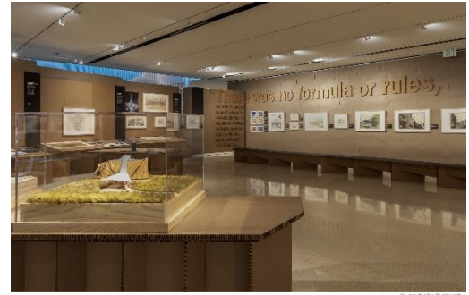
Figure 2 Exhibition photograph, Renegades , photo credit Joseph Mills.

seen in the foreground of the exhibition view shown here (figure 2).