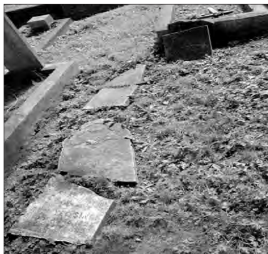
Fig. 3 Fragments of headstones belonging to three Chinese graves.

A few inscriptions on the headstones are legible (see Fig. 4, 5, and 6 for example), while some are difficult or even impossible to identify completely. From the twenty-three dates of death we were able to collect, we determined that the basic sequence of the burials runs from grave 26 (April 2, 1922) to grave 1 (October 12, 1942). With this order in mind, the original locations of the fragments in the bottom left-hand side can be surmised. The fragment with the date of death of August 14, 1922 probably belongs to grave 18, and the other fragment with the date of May 15, 1929 was likely originally on grave 22. In the same way, we inferred that marker 27 should be on grave 7. The fragment of stone without a date bears the name of the deceased, Gong Kee. Since there is only one unmarked plot left, it is very probable that it is from grave 13. Therefore, although the information available for each headstone varies, we have been able to identify all twenty-five graves and their respective headstones. Building on the premise that mortuary studies can provide