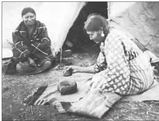
Fig. 4 Cheyenne woman pounding meat into pemmican.

comes from the Cree word meaning “he makes grease” (Colpitts 2014: 8-9). Its most essential feature is hard and soft fats extracted from the marrow of bison’s—and/or other animals—long bones, along with others that are boiled and crushed. Its preparation was labour intensive and difficult to execute properly. Harold Innis recognized the geopolitical significance of this particular processed food in the operation of the fur trade. Just as corn and grease were essential to the trade between Montréal and Lake Superior, so too was pemmican essential for its expansion into the Athabasca and the northwest. Innis acknowledged that these foodstuffs were essential and that “in the production of pemmican the Plains Indians occupied a strategic position,” an admission of Indigenous agency and importance absent in other histories of the time (Innis 1973 [1956]: 235). Arthur Ray advanced the study of the role of Indigenous hunters, identifying the importance of “country produce,” which he defines as “food and a variety of other products,” the procurement of which together became “a core economic activity for many aboriginal economies