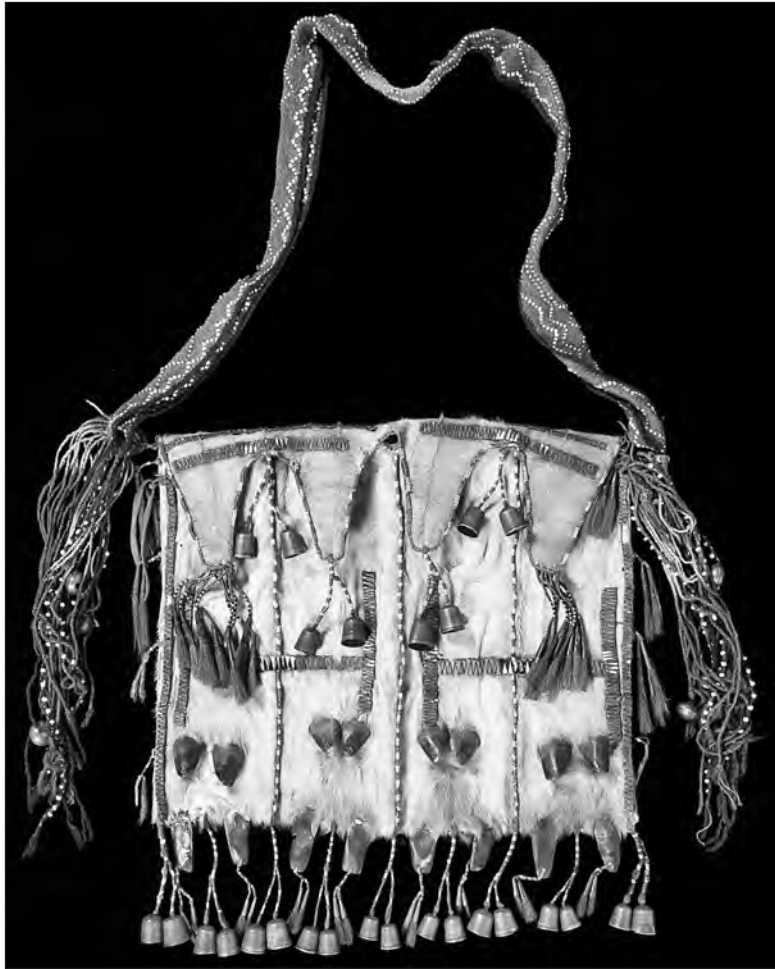
Fig. 3 Shoulder Bag. Pitt Rivers Museum. Catalogue or Unique ID Number: 1954.9.22.

goods of the fur trade were often recycled and repurposed sonorous elements to clothing in a distinctively Indigenous style. Cultural hybridity in fashion became naturalized and identified with the clothing of both Indigenous peoples and fur traders.